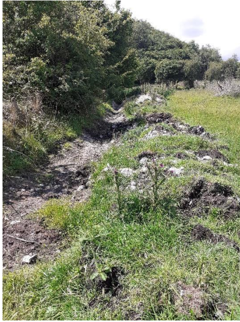
Figure 6: Drain with works, running along county boundary.

While taking photographs, [REDACTED] landowner, [REDACTED] approached me. I identified myself, showing my Authorisation Card and informed [REDACTED] I was there investigating the works as they were within the designated site and that works of this nature would likely need consent of the Minister due to being within the site. [REDACTED] informed me he was [REDACTED].