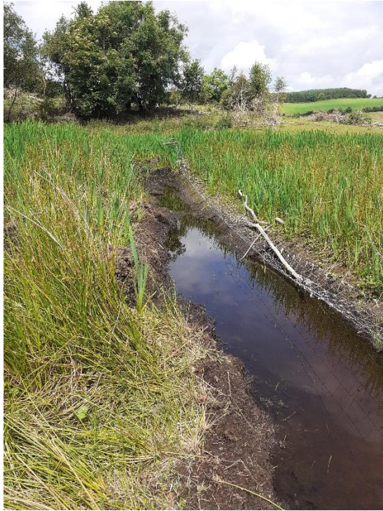
Figure 2: Newly established drain. Wetland end.