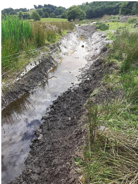
Figure 3: Newly established drain, looking east.