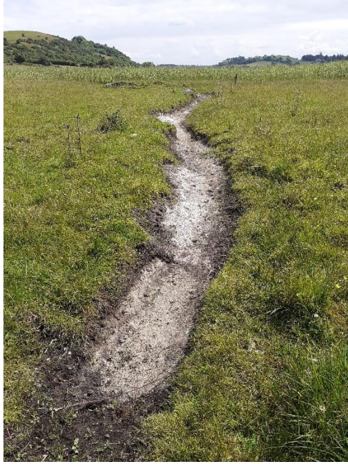
Figure 4: Small drain to east of lands running to Lough Bane.