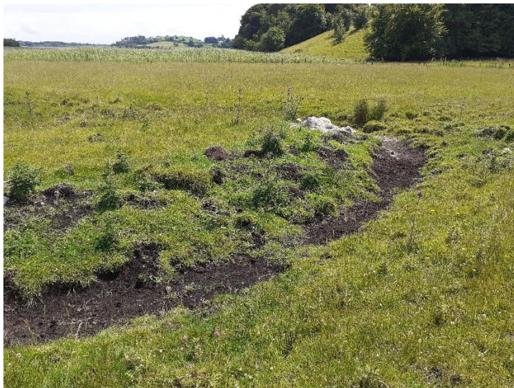
Figure 5: Pre-existing drain with works, leading to Lough Bane.