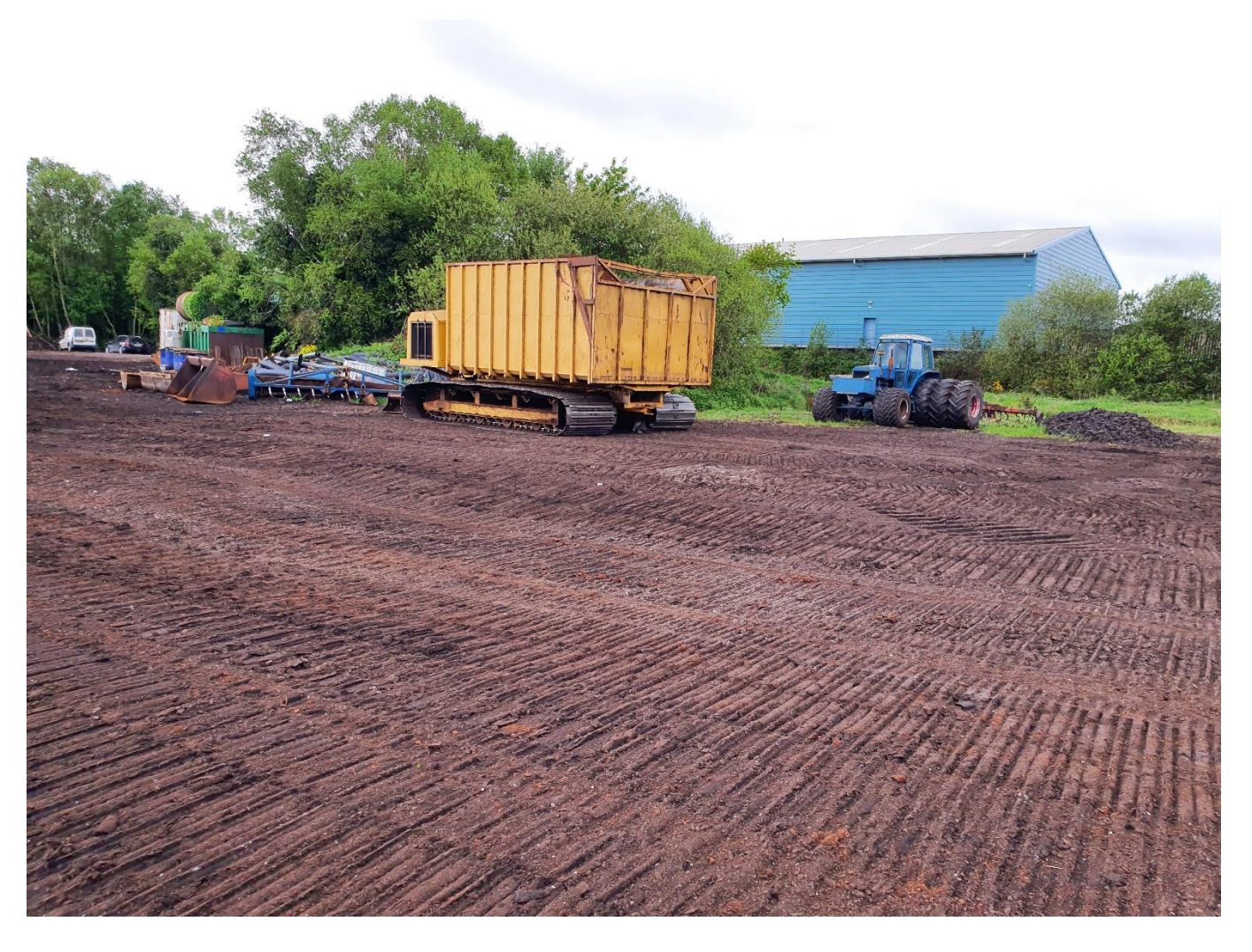
Photo 4: Tracked dumper and peat harvesting machinery noted at the loading area.