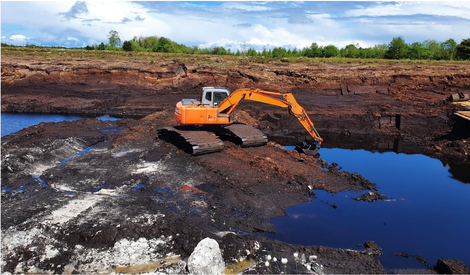
Photo 1: Excavator noted in the area where peat had been excavated.