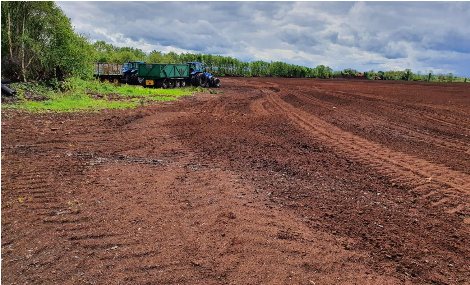
Photo 1: Peat harvesting machinery and two excavators on milled peat stockpile in the distant background.