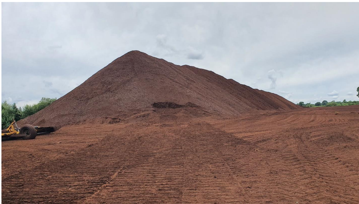
Photo 4: Large stockpile of milled peat noted on [REDACTED] peatland.