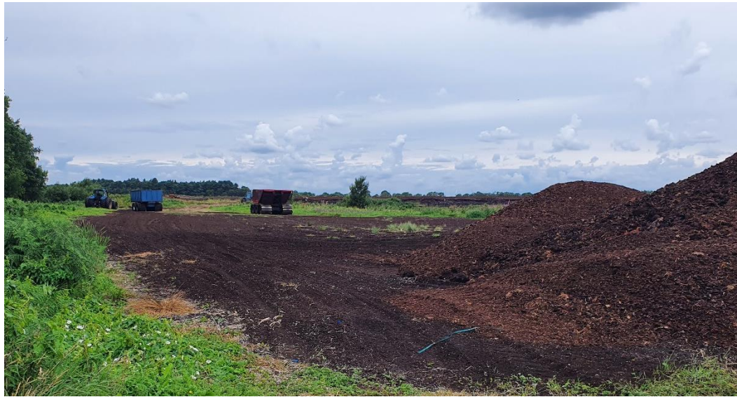
Photo 6: Peat harvesting machinery noted on adjoining peatland within the bog complex.