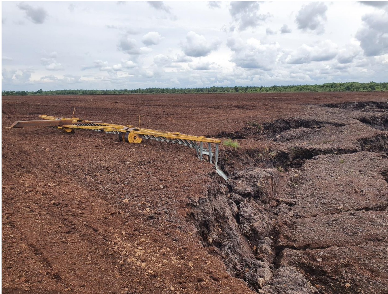
Photo 7: Peat harvesting machinery noted on adjoining peatland within the bog complex.