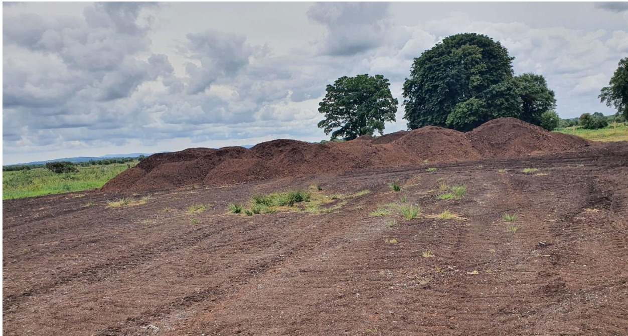
Photo 5: Stockpile of milled peat noted on adjoining peatland within the bog complex.