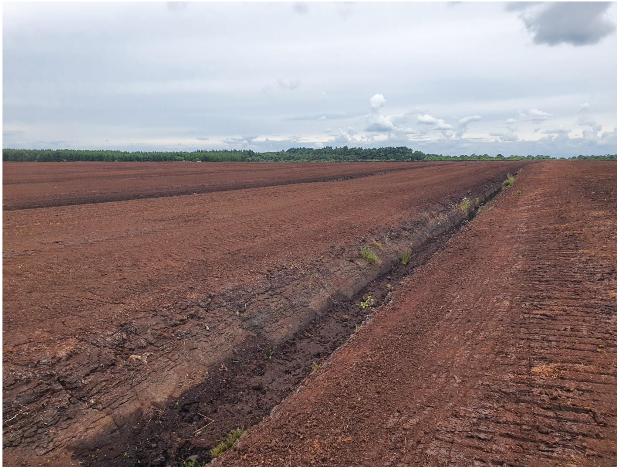
Photo 3: Recently harvested milled peat noted on [REDACTED] peatland.