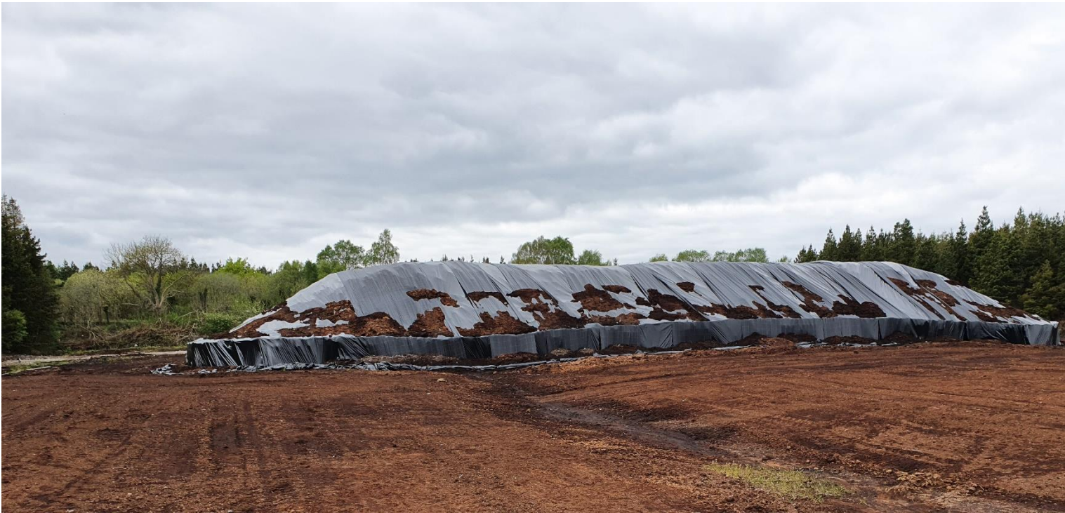
Photo 2: Significant stockpile of sod peat covered with plastic at loading area.