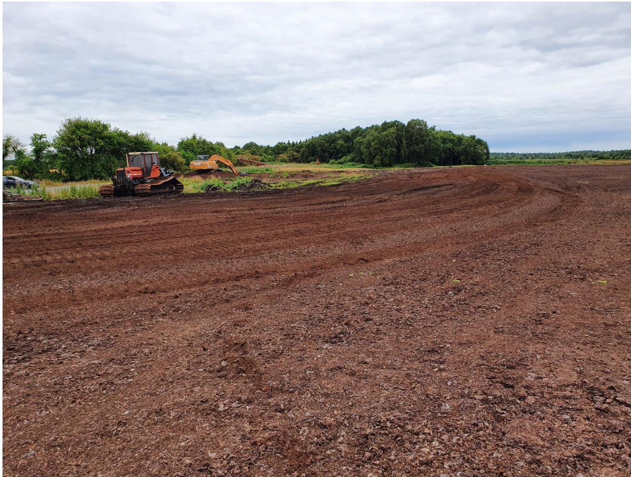
Photo 2: Milled peat area with reduced stockpile of milled peat noted in the distance.