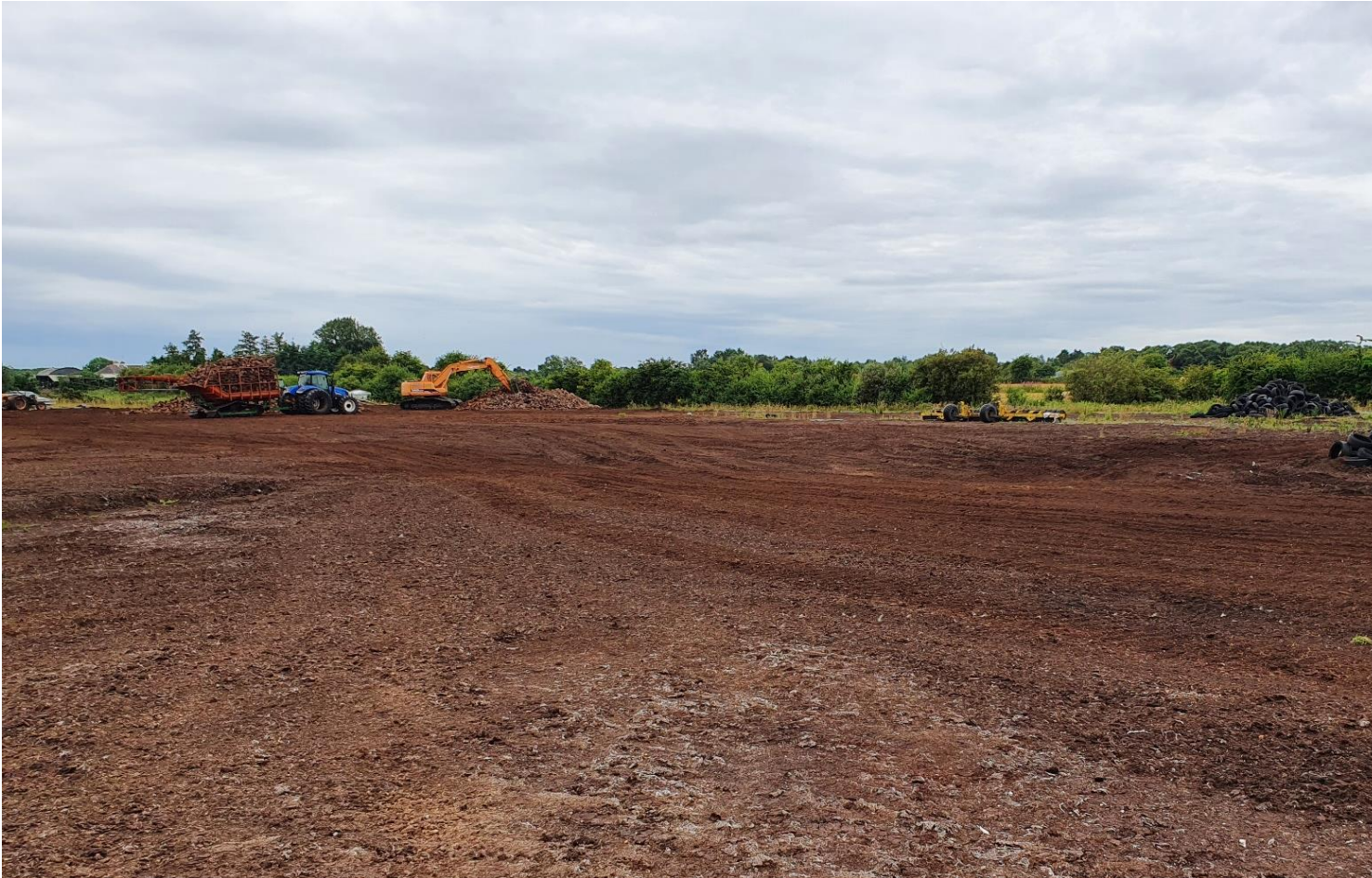
Photo 4: Tractor and tracked trailer for sod peat collection noted on the bog.