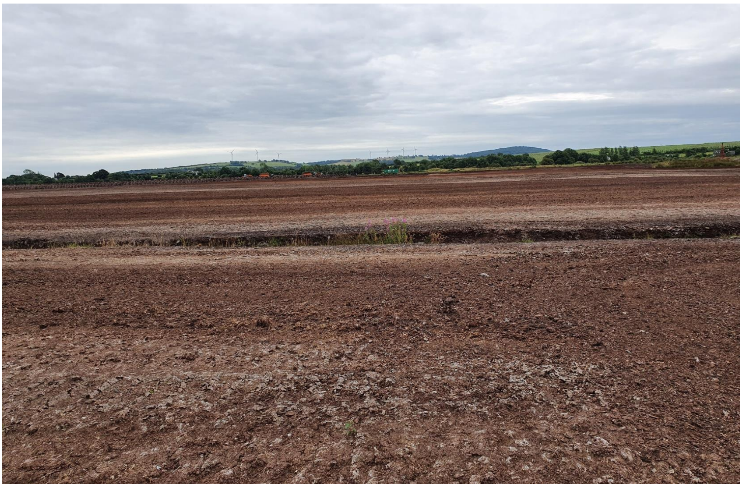
Photo 3: No activity noted on milled peat section of the peatland.