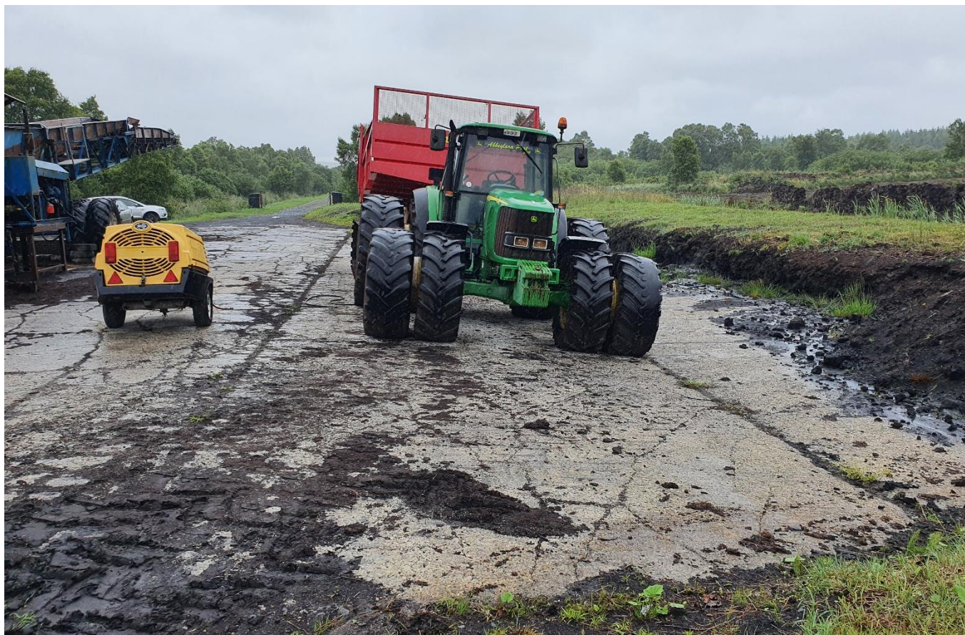
Photo 2: Peat harvesting machinery/equipment noted at the loading area.