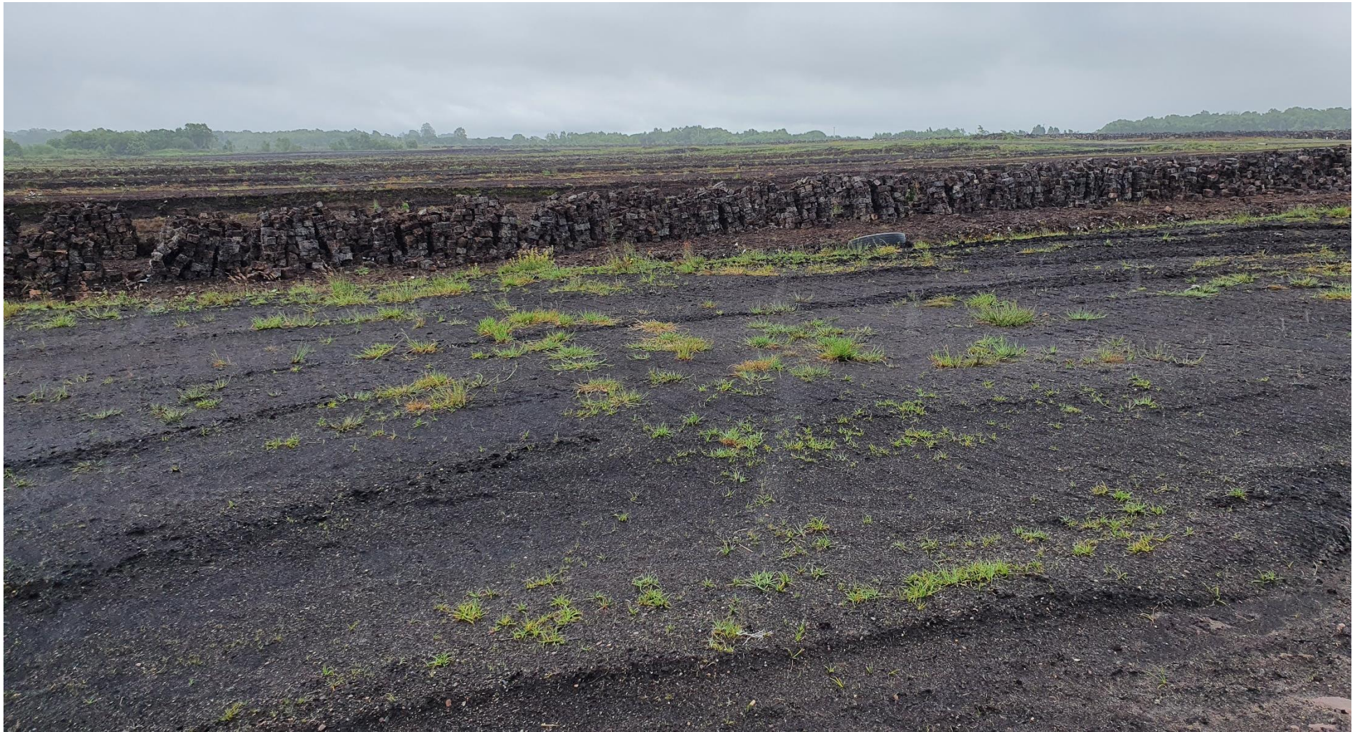
Photo 3: Sod peat which had been walled prior to removal off-site.