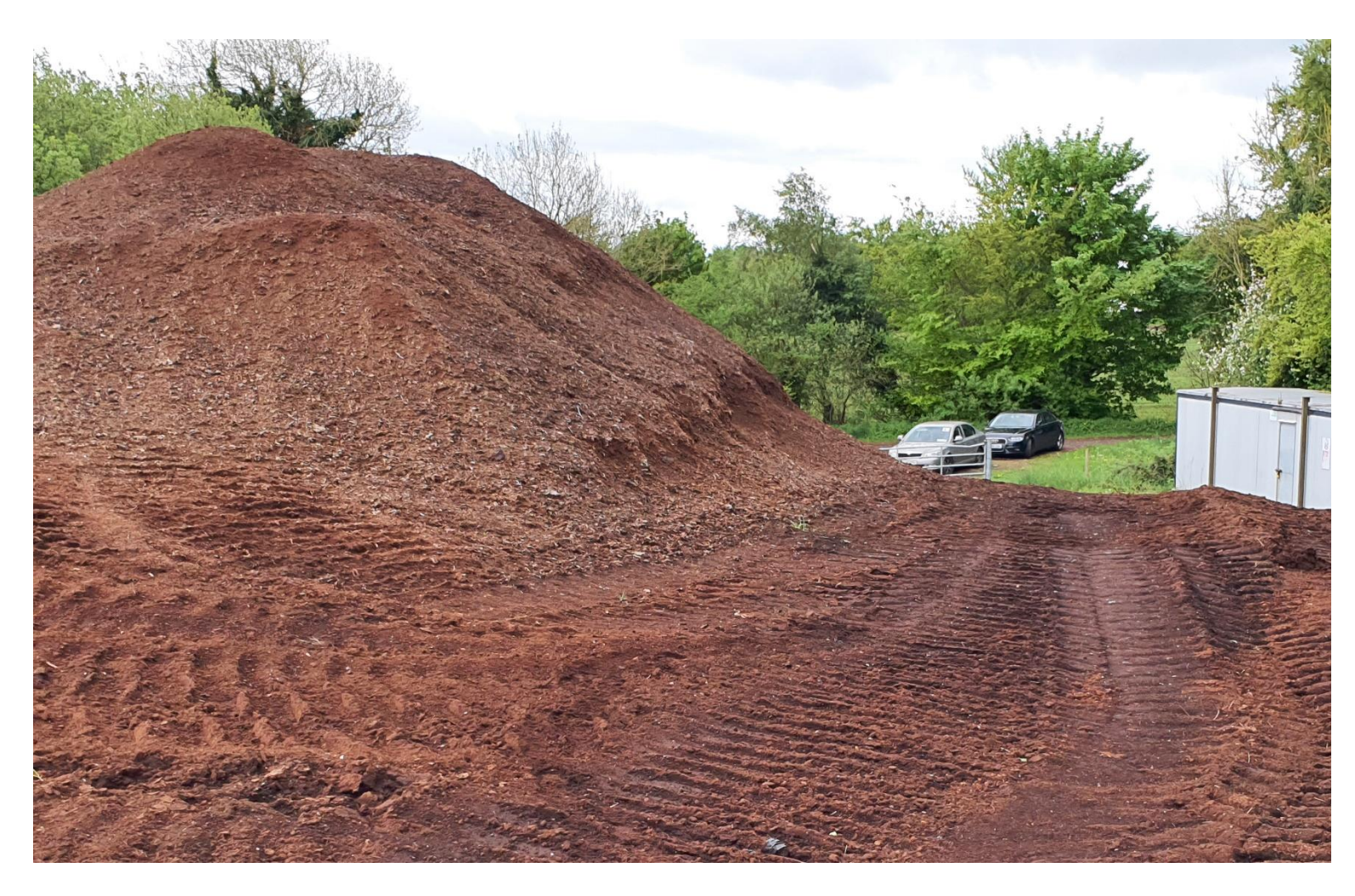
Photo 5: Large stockpile of milled peat noted at southern end of the peatland.