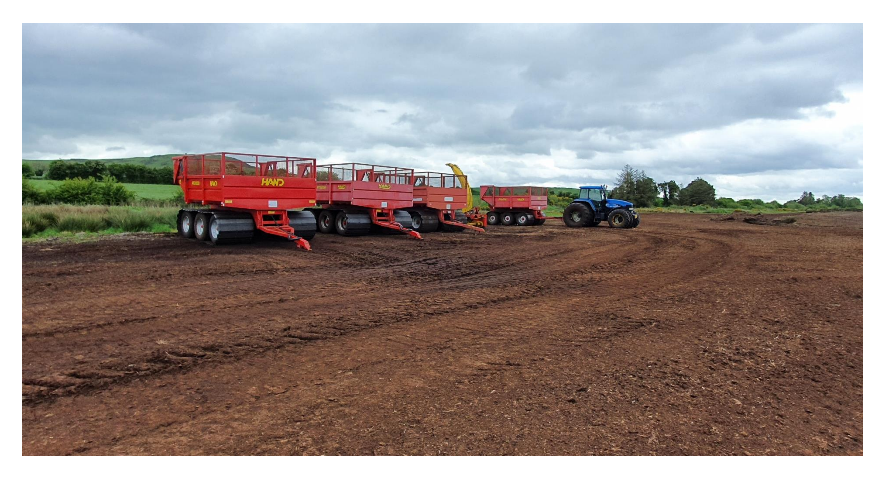
Photo 2: Milled peat machinery and equipment noted on the peatland.