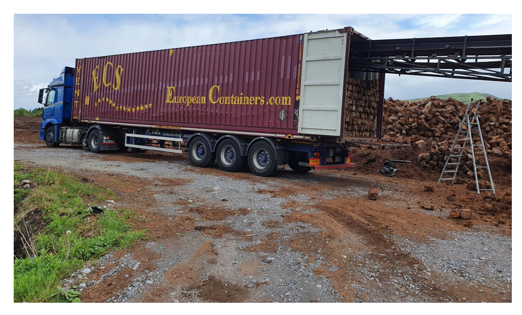
Photo 3: Loading of sod peat onto container for export at loading area.