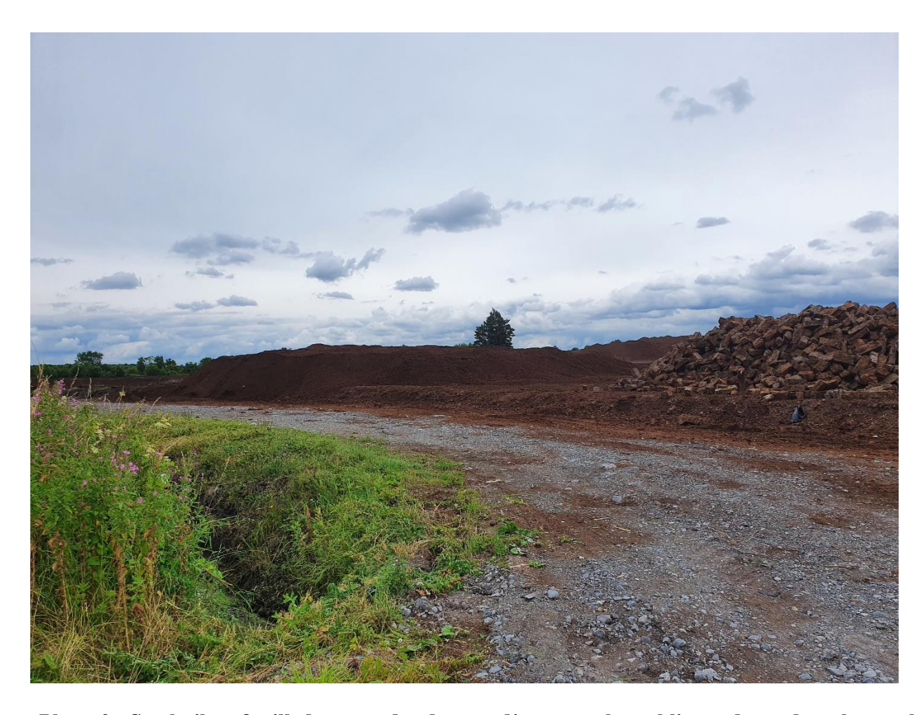
Photo 2: Stockpiles of milled peat and sod peat adjacent to the public road noted on the peatland.