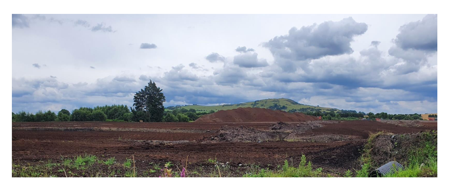
Photo 4: Large stockpile of milled peat at the northern end of the peatland.