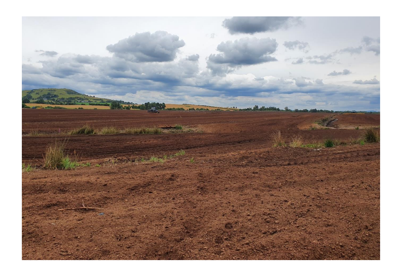
Photo 1: Two tractors with peat harvesting machinery noted to be working on the peatland.