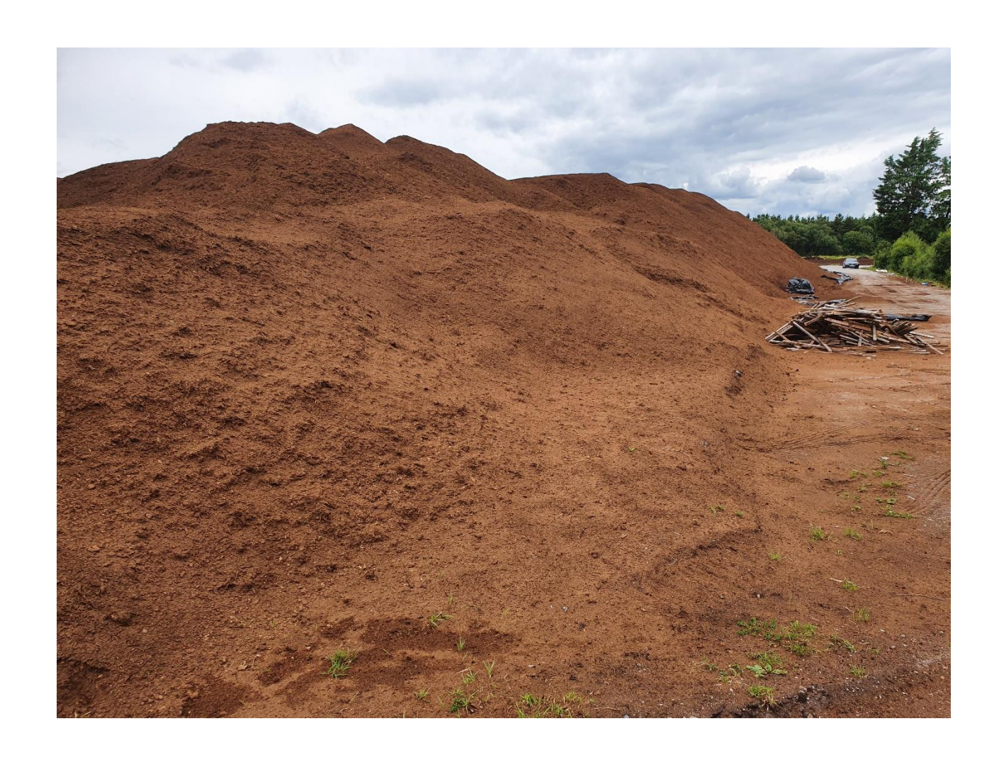
Photo 3: Large stockpile of milled peat noted at northern end of the peatland.