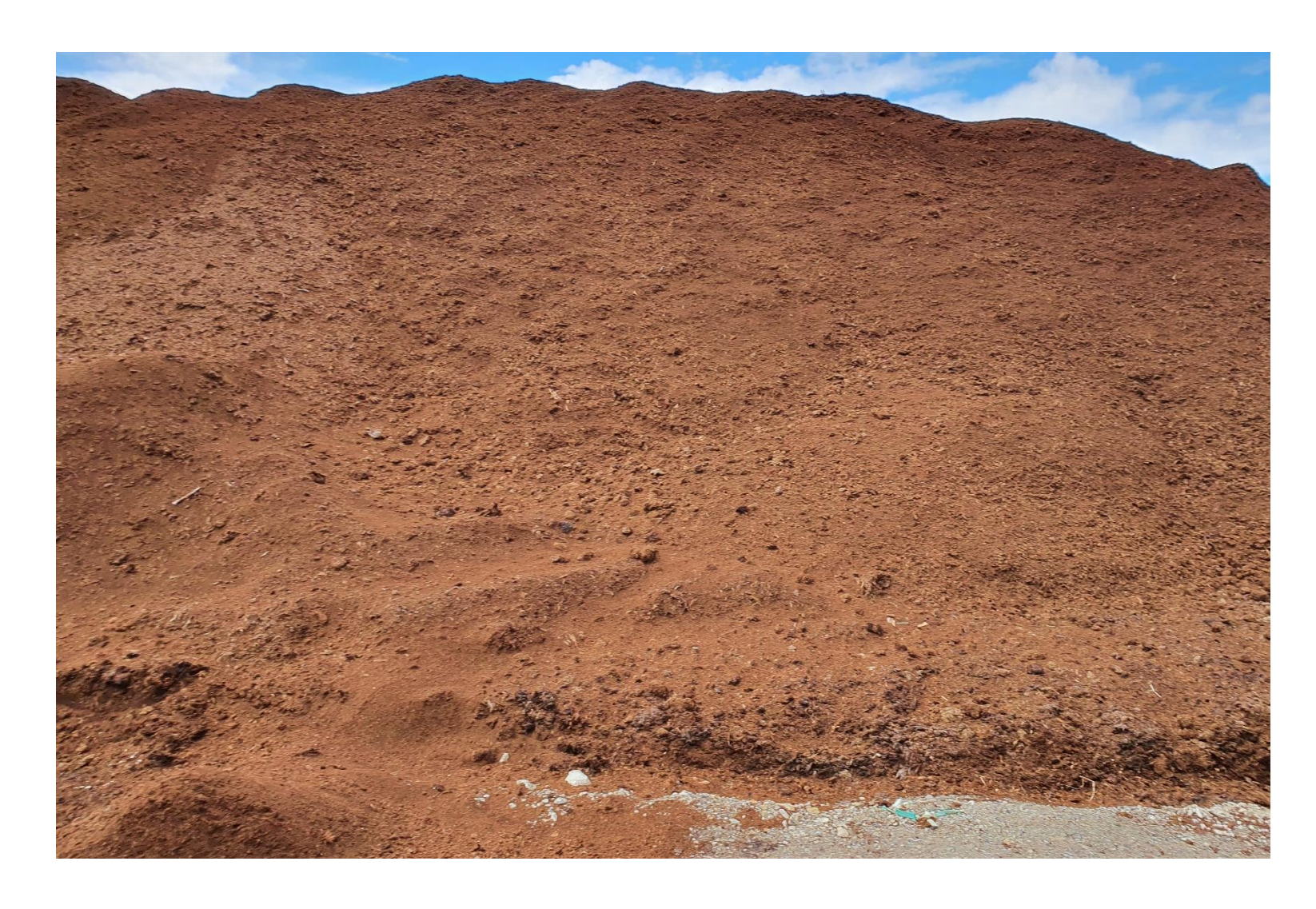
Photo 1: Significant stockpile of milled peat at the northern section of the peatland.