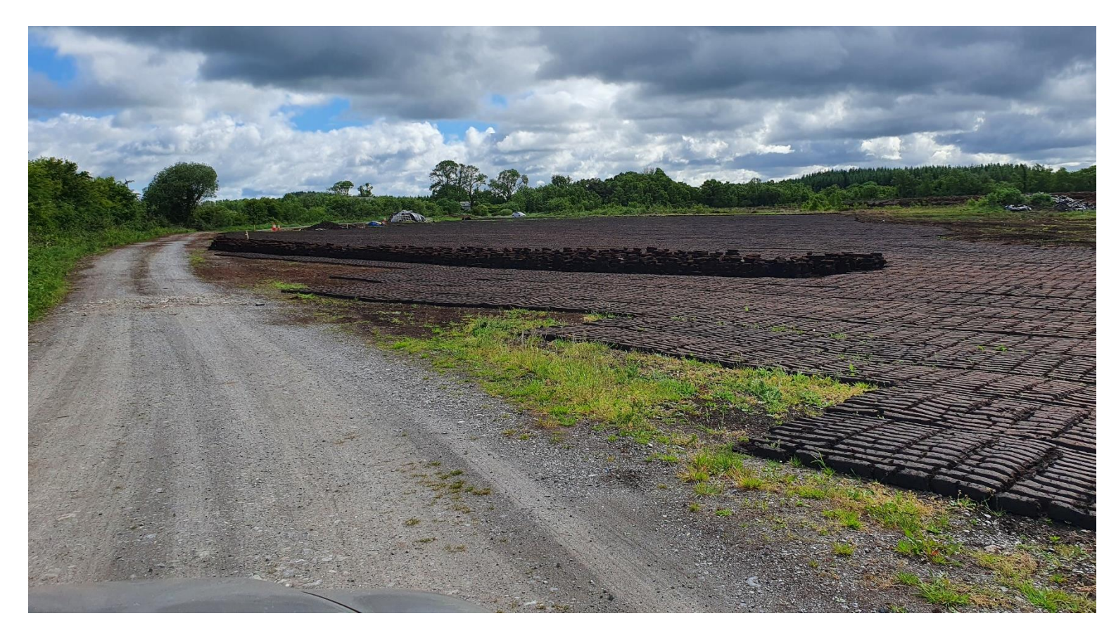
Photo 2: Recently excavated hopper turf with adjacent to loading area with large sod peat stockpile in the background substantially removed.