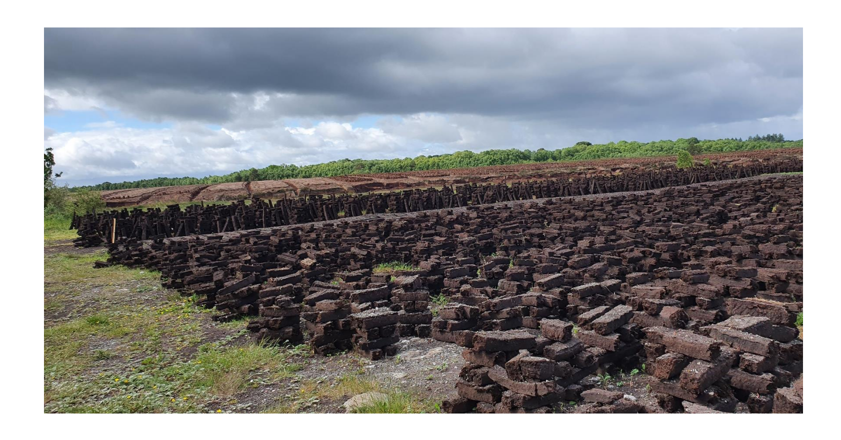
Photo 1: Recently excavated hopper turf with large sod peat noted in the background left out to dry on peatland.