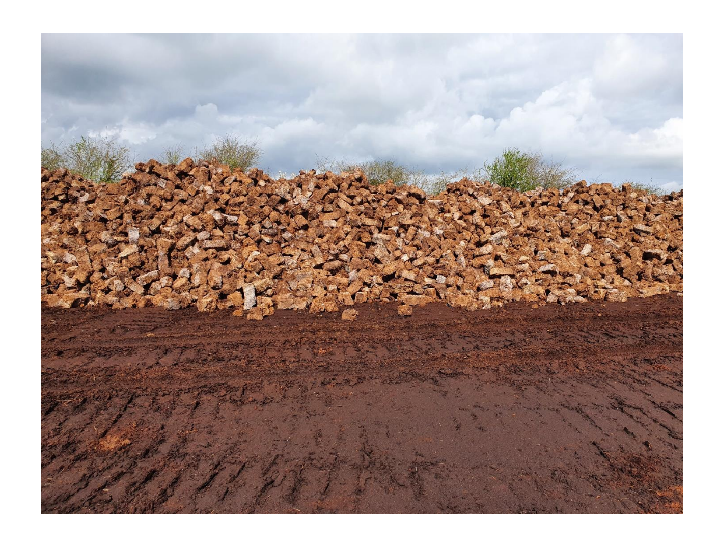
Photo 1: Recently collected stockpile of large sods noted on the bog.