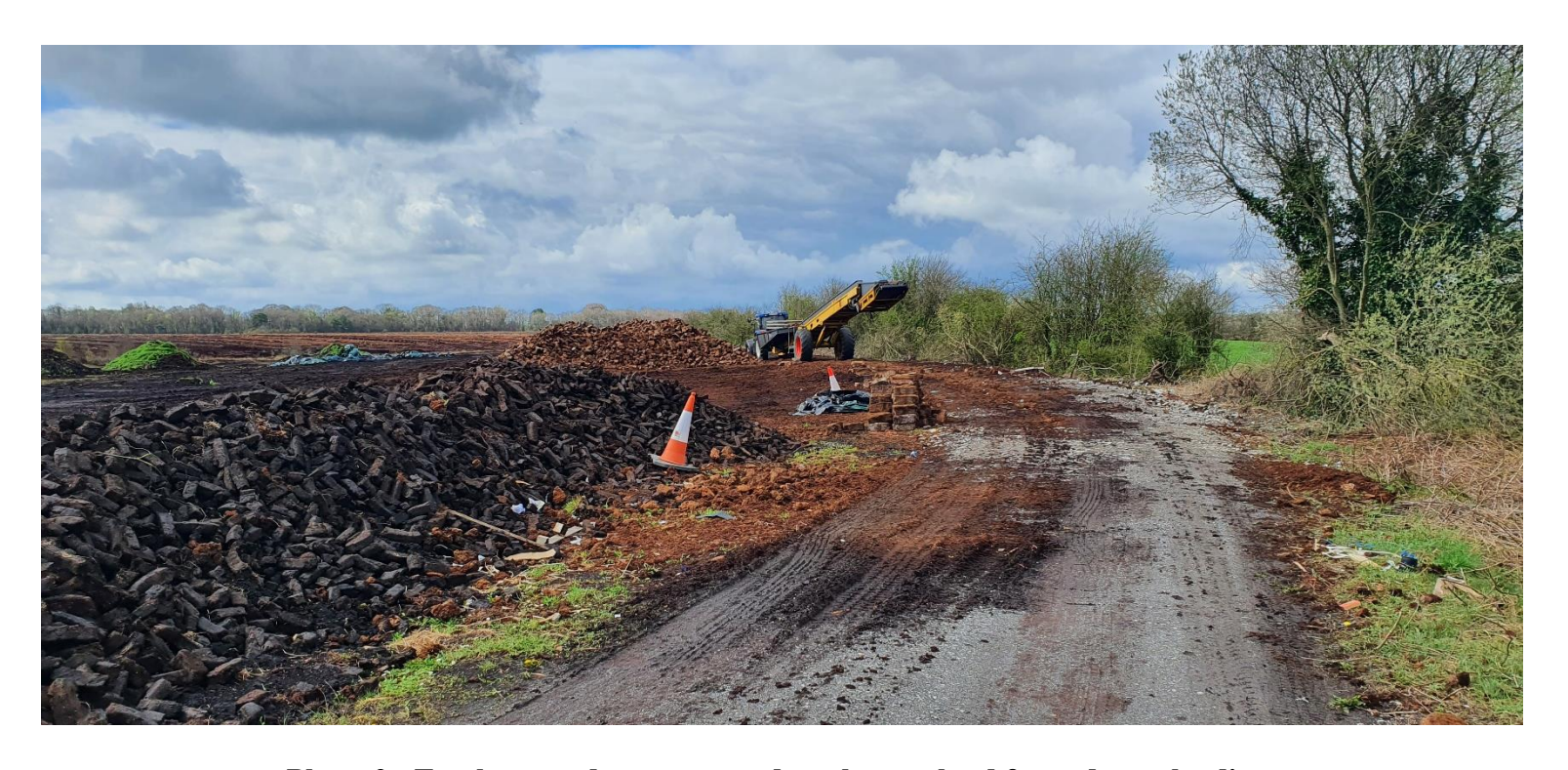
Photo 2: Escalator and tractor noted on the peatland for sod peat loading.