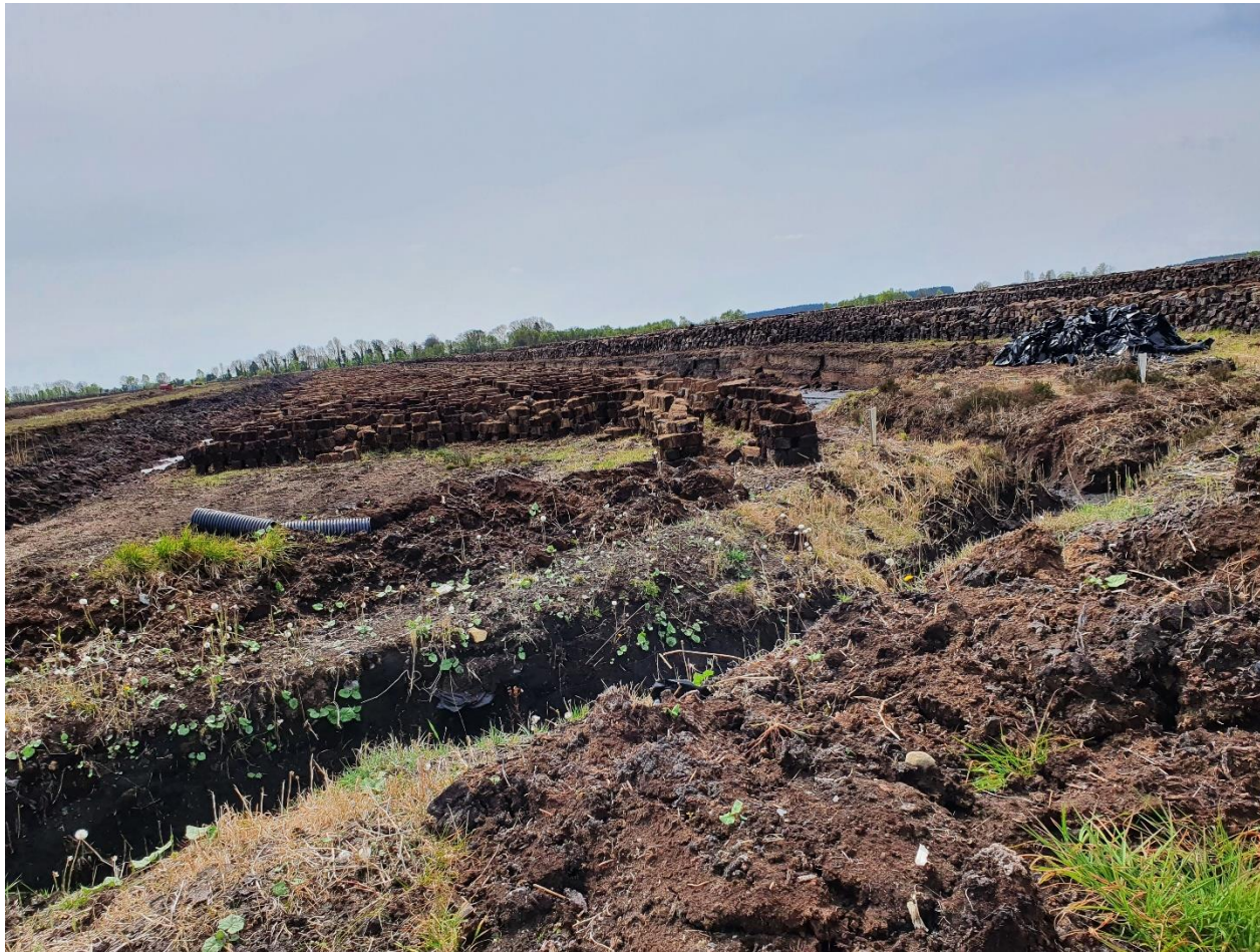
Photo 5: Sod peat left out and turned for drying noted on the bog.