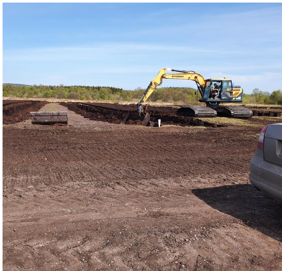
Photo 1: Sod peat excavation noted to be ongoing during the visit .