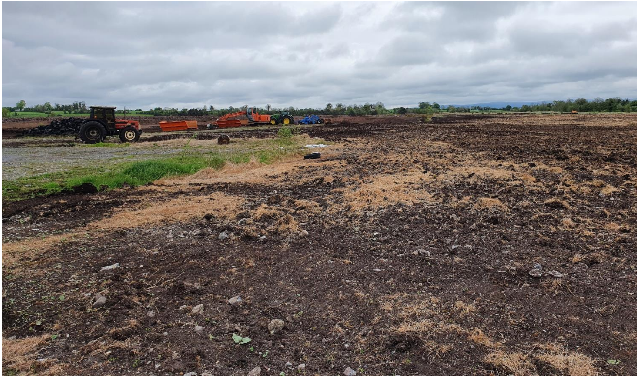
Photo 4: Recently rotovated area adjacent to the loading area noted along with peat harvesting machinery and equipment.