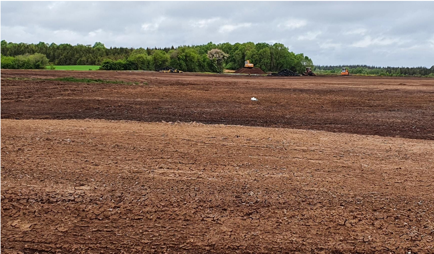
Photo 3: Milled peat area with stockpile of milled peat noted in the distance.