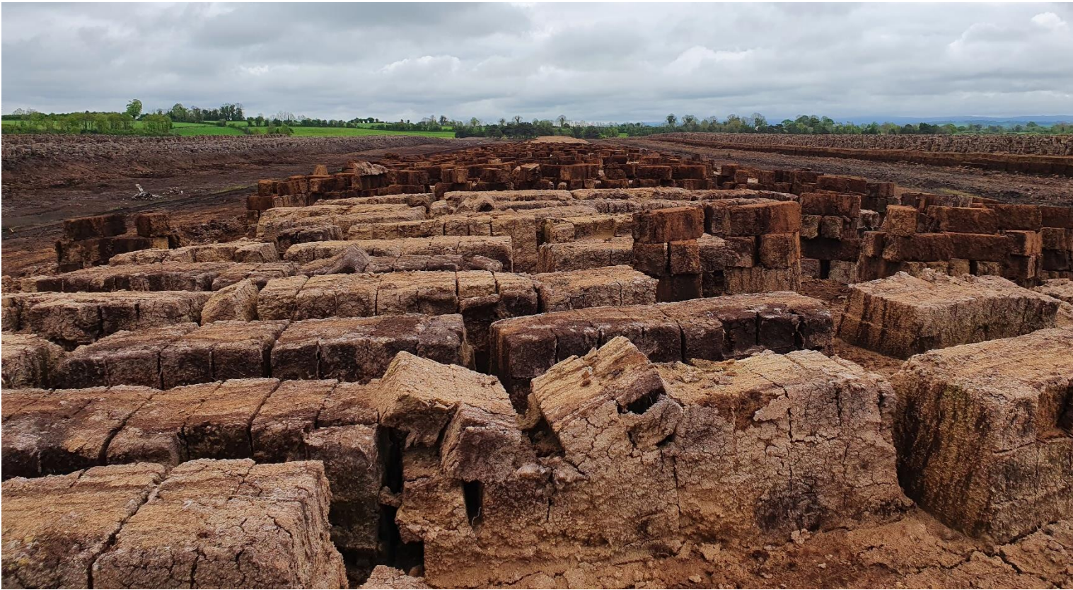
Photo 1: Recently turned and ‘clamped’ sod peat for drying noted on the peatland.