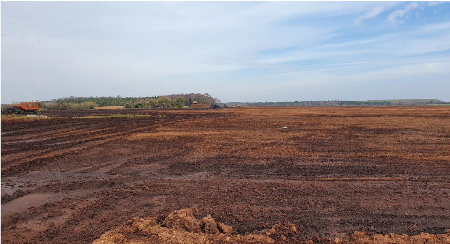
Photo 2: Milled peat area with stockpile of milled peat noted in the distance.