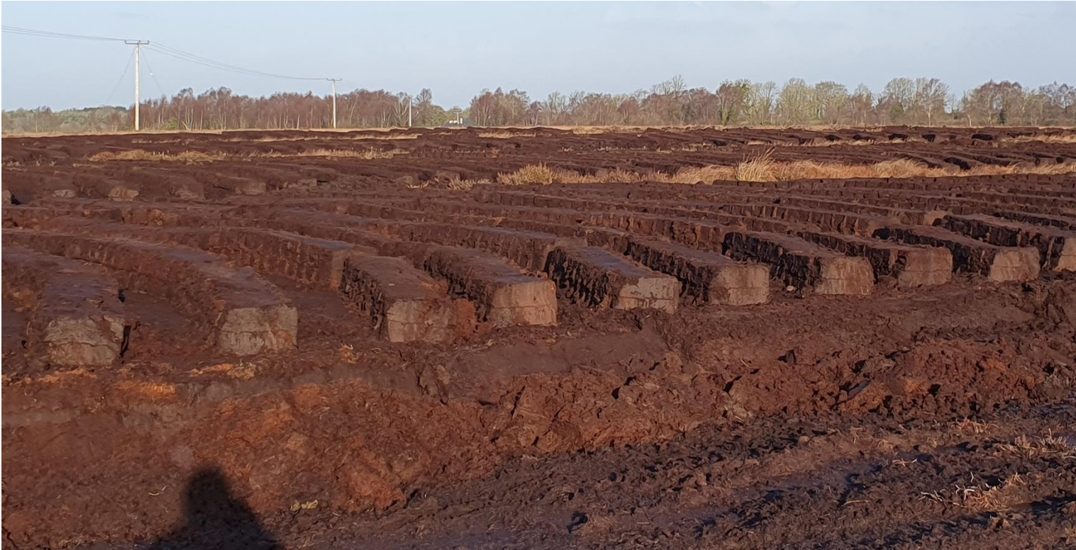
Photo 1: Recently excavated sod peat left out to dry on the peatland.