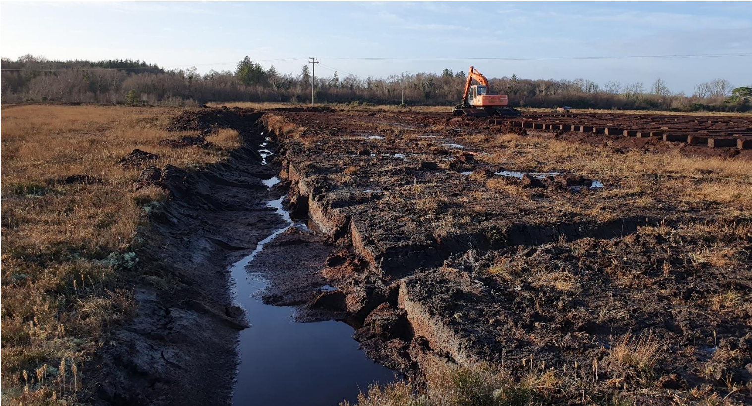
Photo 4: Drainage works in preparation for excavation noted on the peatland.