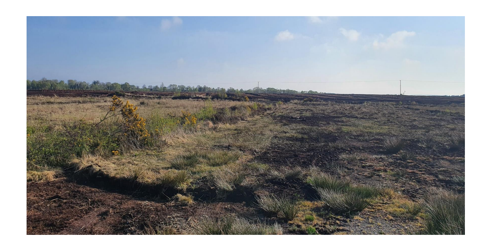
Photo 1: Recently excavated sod peat left out to dry on the peatland.