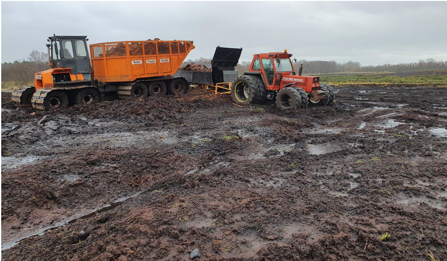
Photo 7: Tracked dumper containing sod peat and escalator for loading peat.