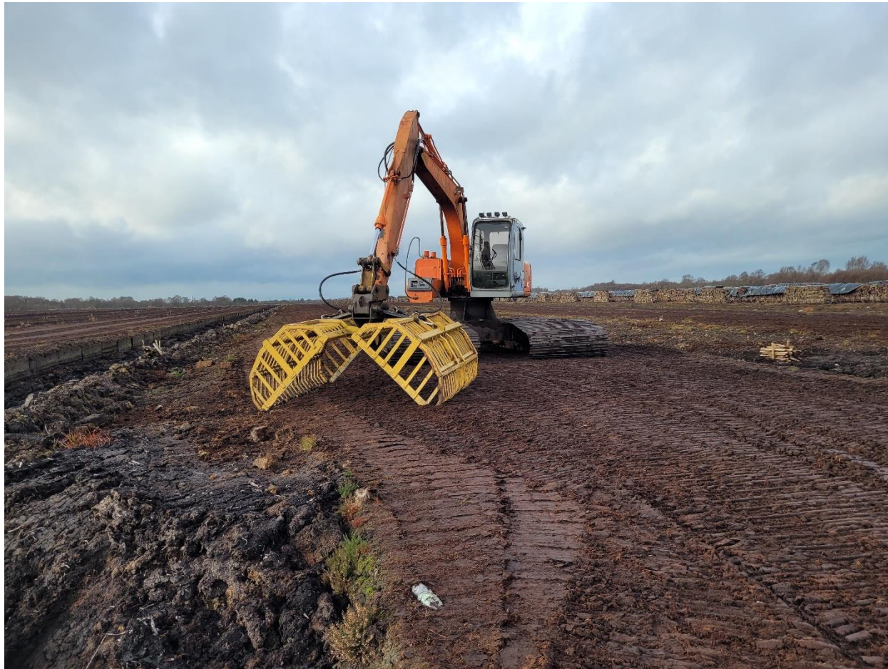
Photo 1: Excavator noted on the peatland with sod peat collector attached.