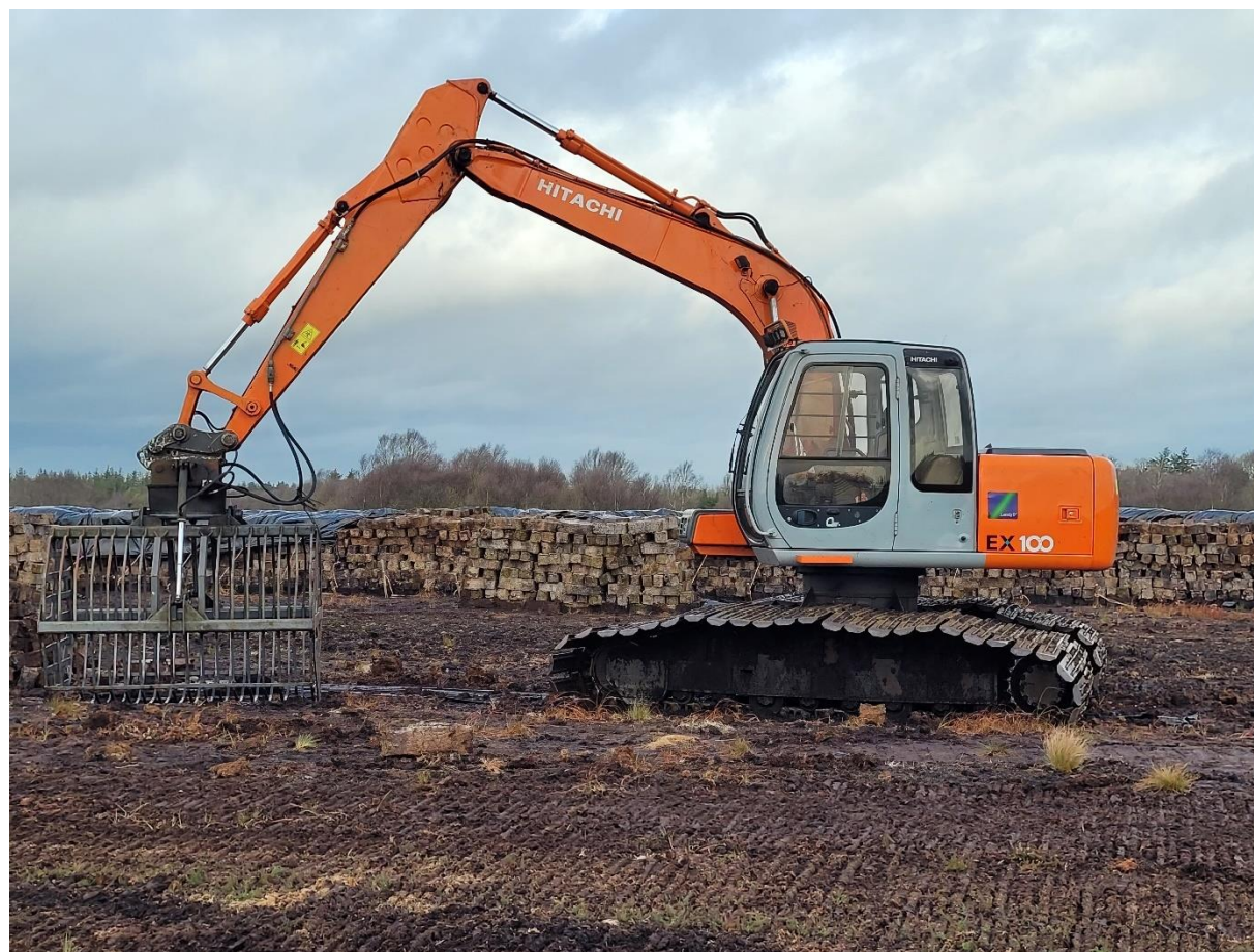
Photo 2: Excavator noted on the peatland with sod peat collector attached.