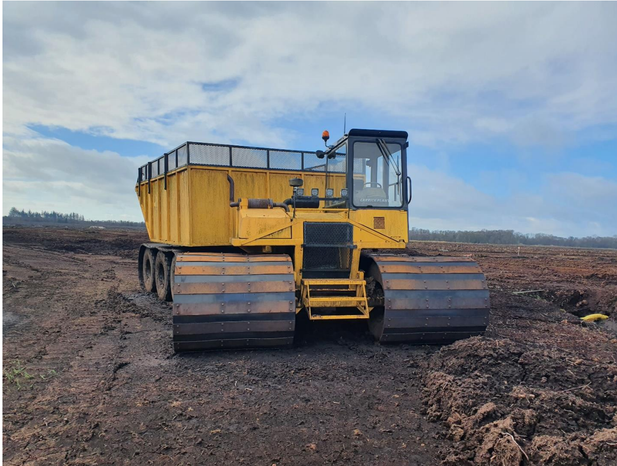
Photo 4: Tracked dumper containing sod peat and escalator for loading peat.