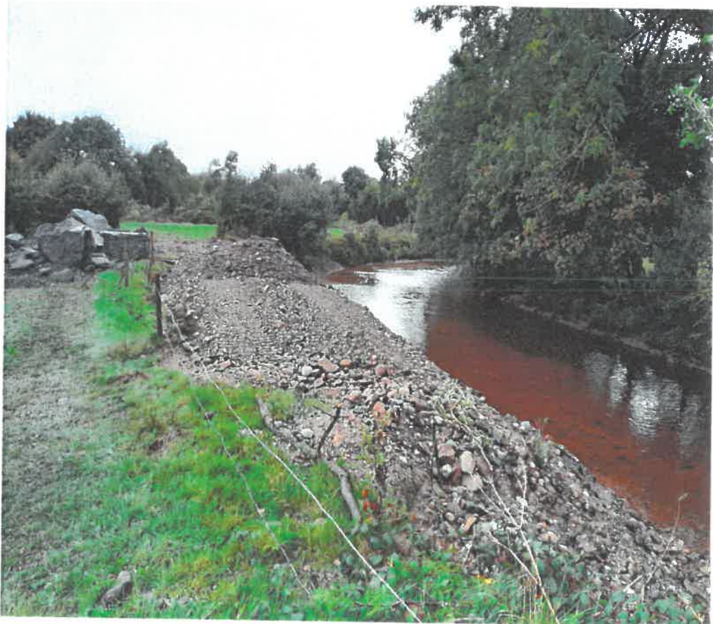
Large Rock, for rock armouring and riverbed removed from channel