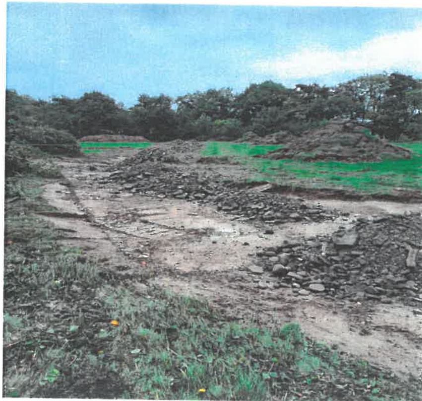
River gravel stockpiled