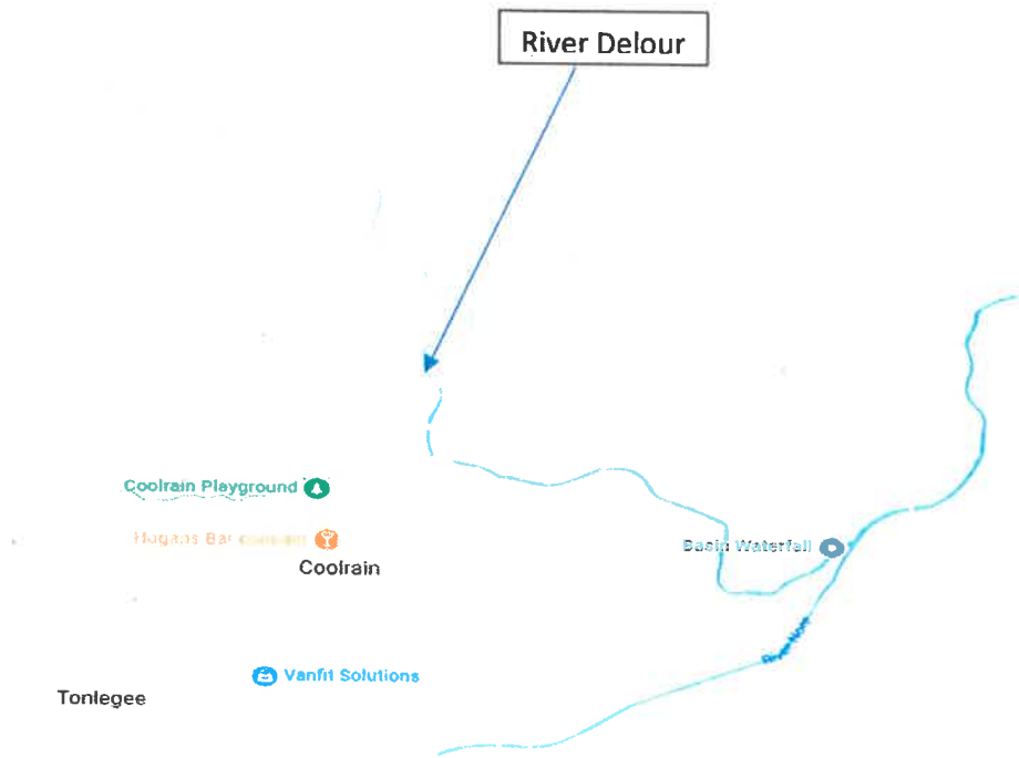
Fig 1 Delour River