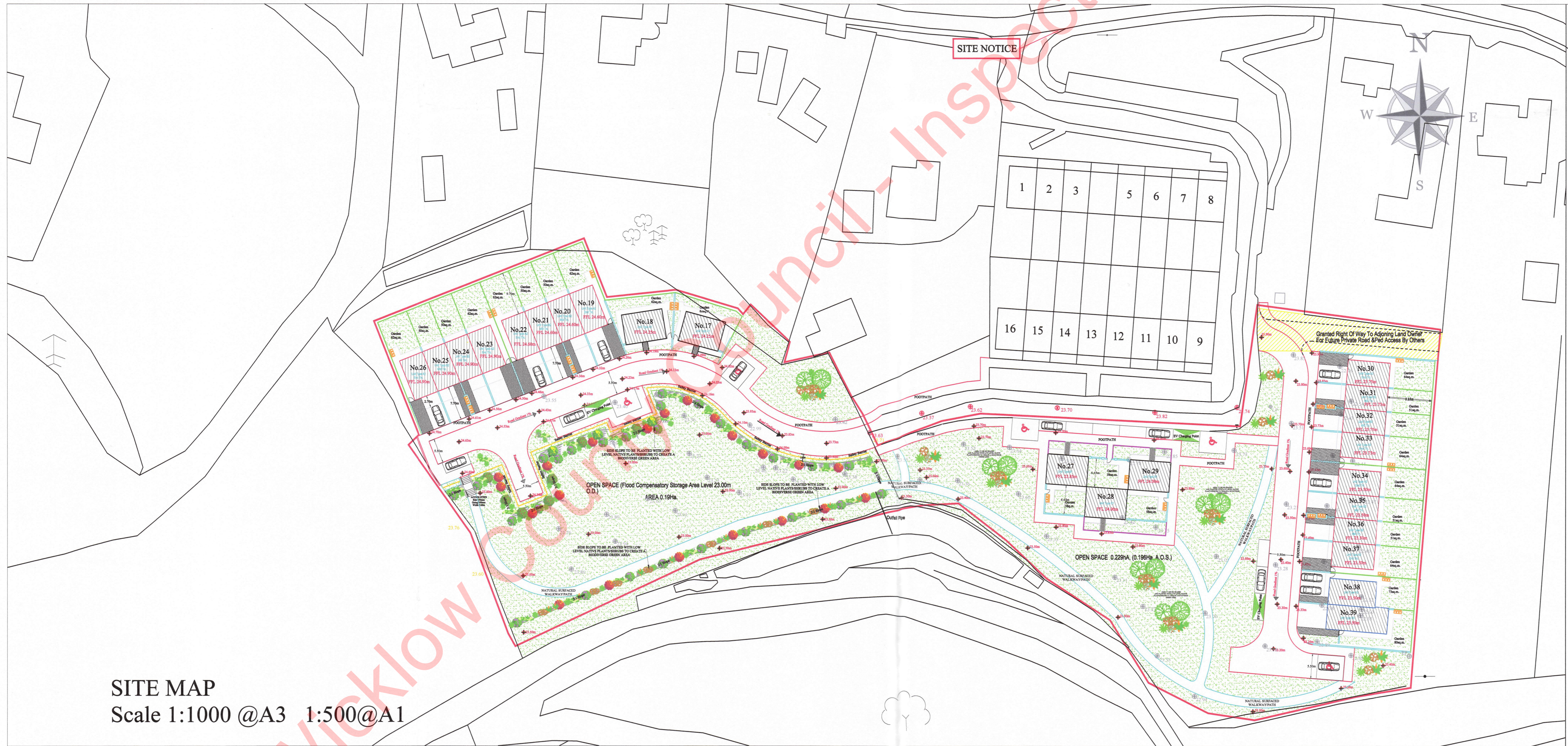
SITE MAP Scale 1:1000 @A3 1:500@A1