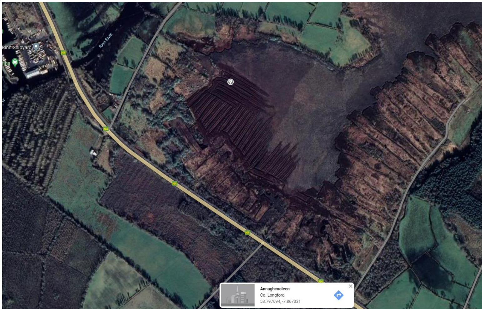
Figure 1: Map showing the location of Annaghcooleen Bog.