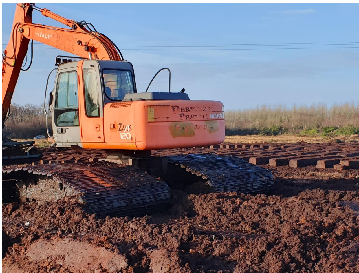
Photo 3: Excavator with Derrymore Peat Ltd logo noted at the peatland.