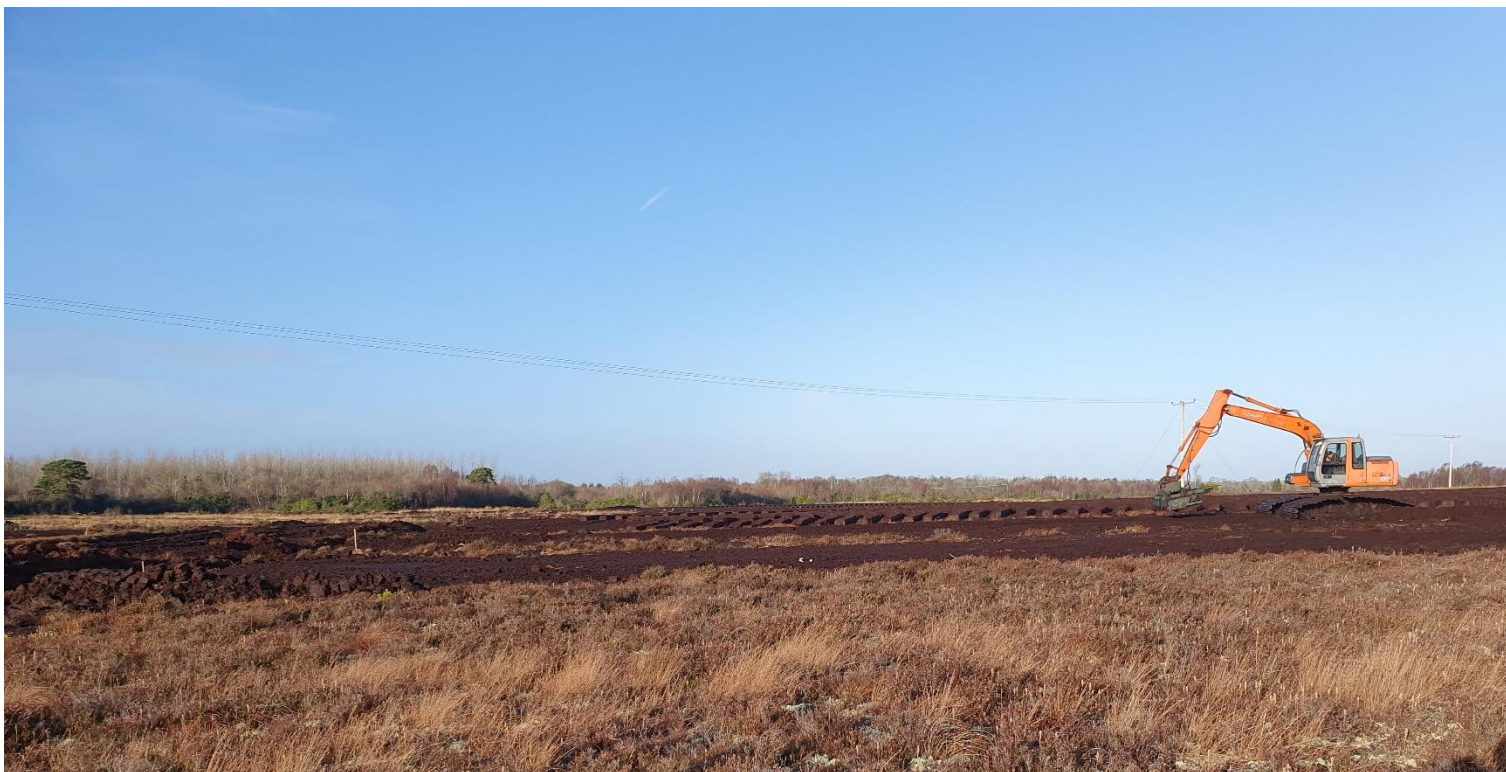
Photo 2: Excavator with large sod peat attachment noted to be working on the peatland.