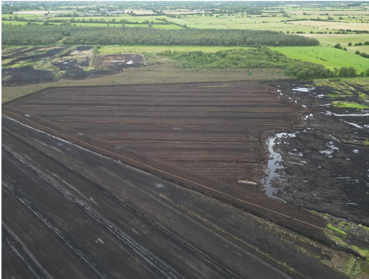
Photo 3: Peat harvesting machinery/equipment on adjoining peatland.