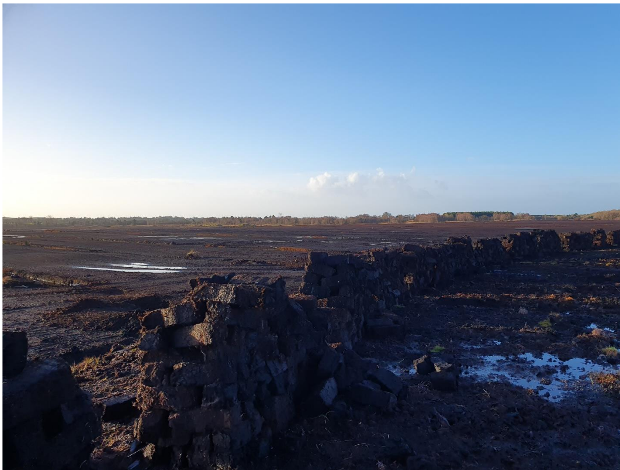
Photo 2: Excavated large sod peat left out on the peatland for drying.