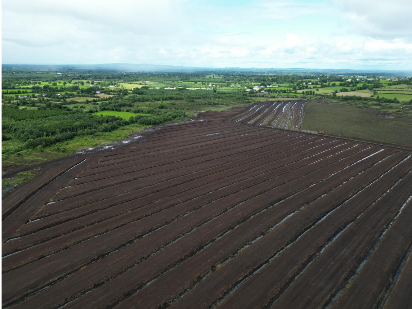
Photo 2: Two excavators noted in the North/North Western section of peatland where large sod peat had recently been removed.