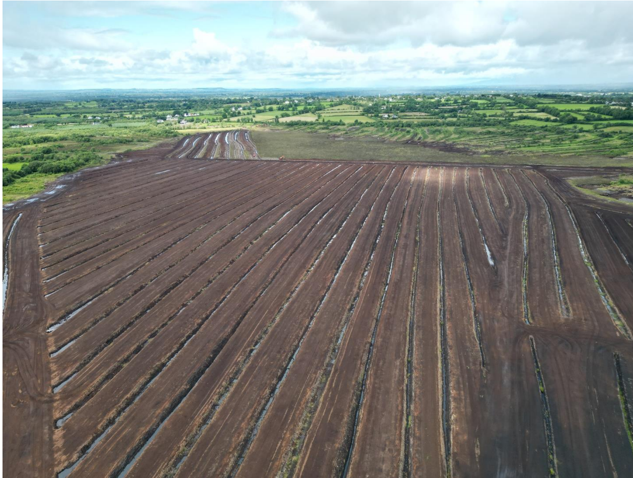
Photo 5: Significant quantities of water noted in the drainage network on the peatland.