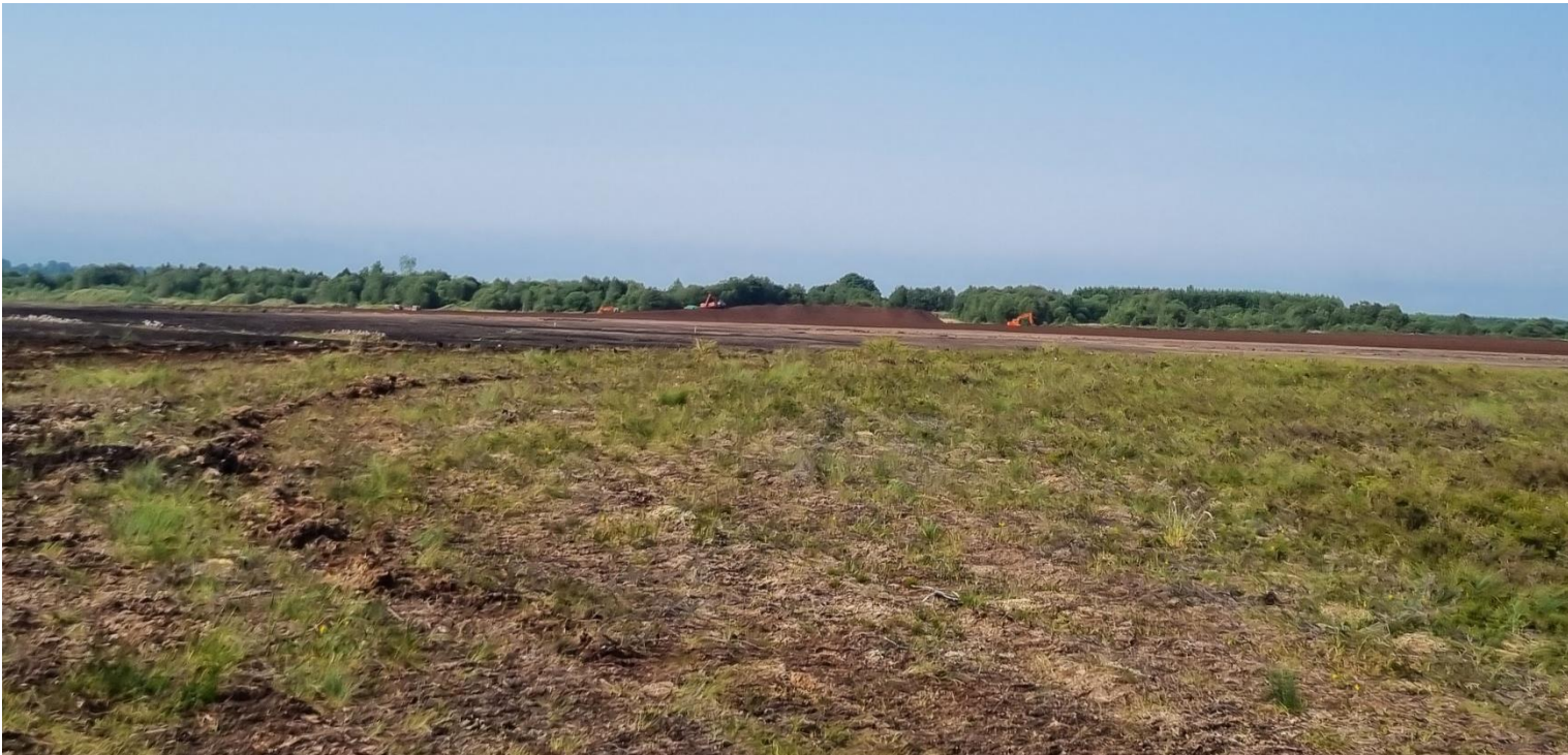
Photo 2: Large stockpile of milled peat noted along with three excavators.