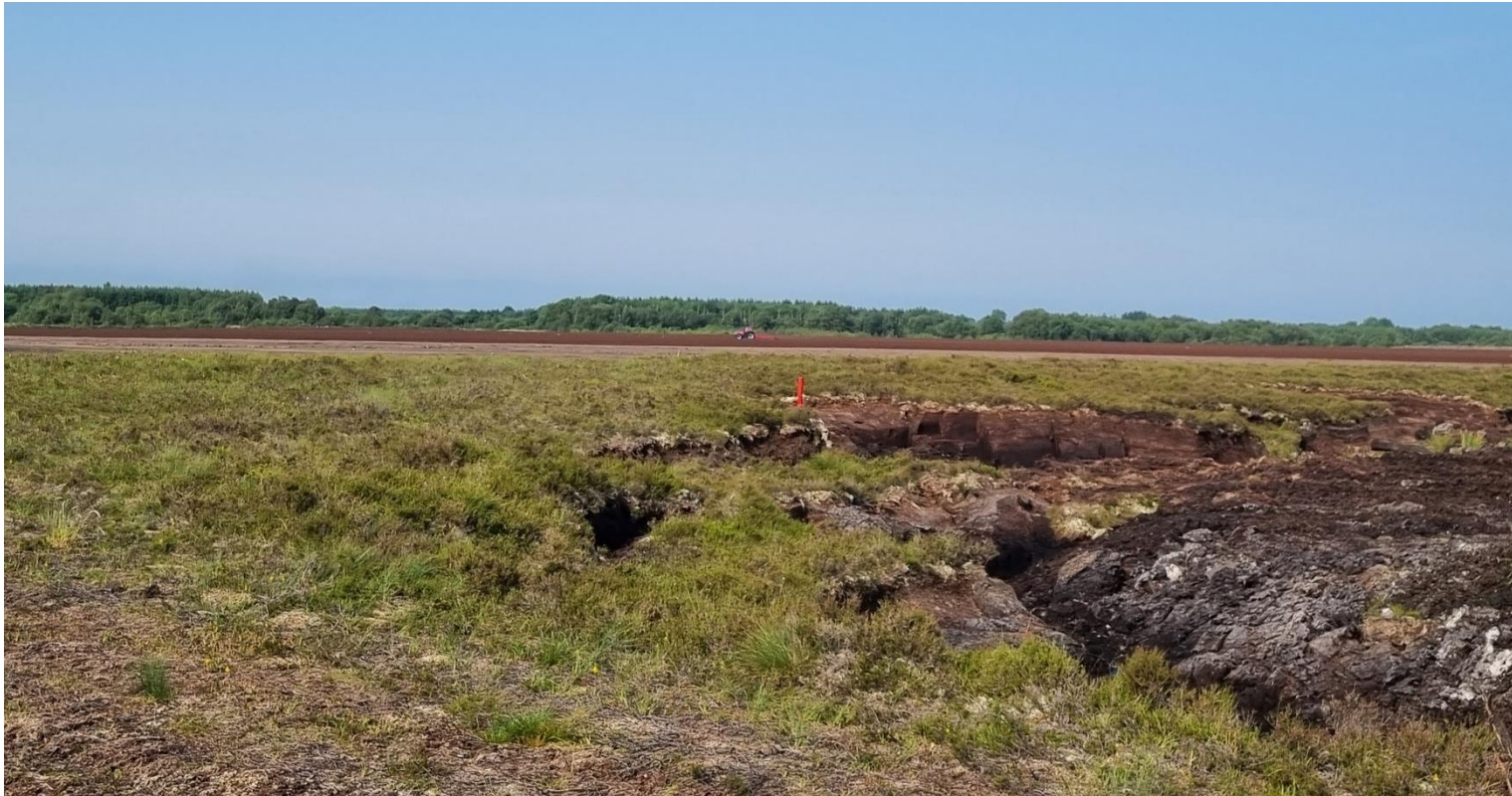
Photo 1: Peat extraction ongoing during the visit - Note milling of peat taking place by tractor with attachment.