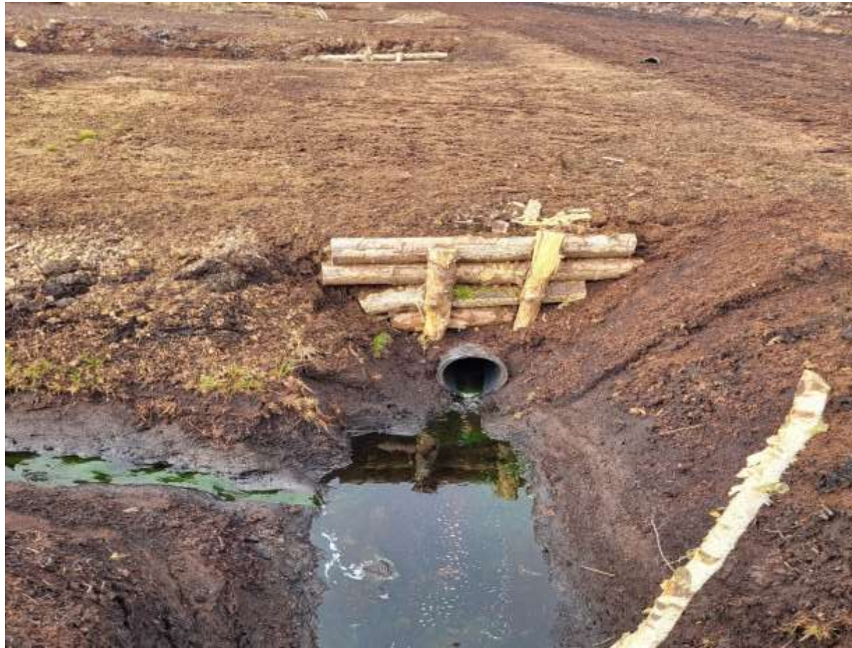
Photo 3: Recently completed drainage and access works noted during the visit.