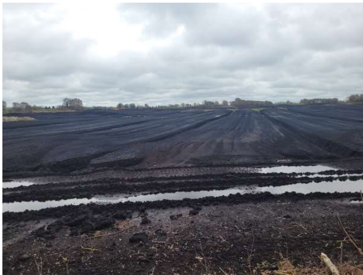
Photo 1: Large scale commercial peat extraction noted at Milltownpass Bog