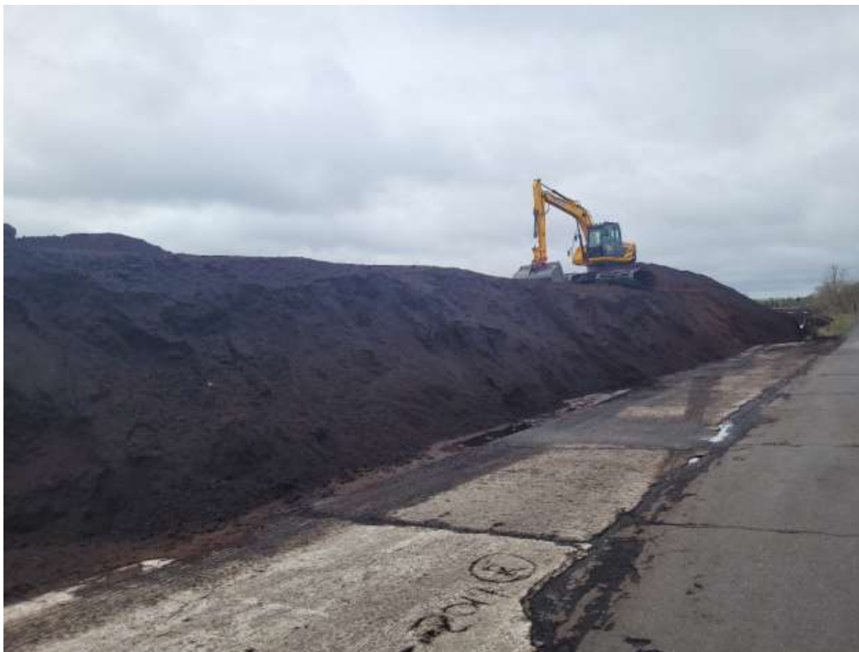
Photo 2: Excavator noted on the large stockpile of milled peat at the loading area adjacent to the public road