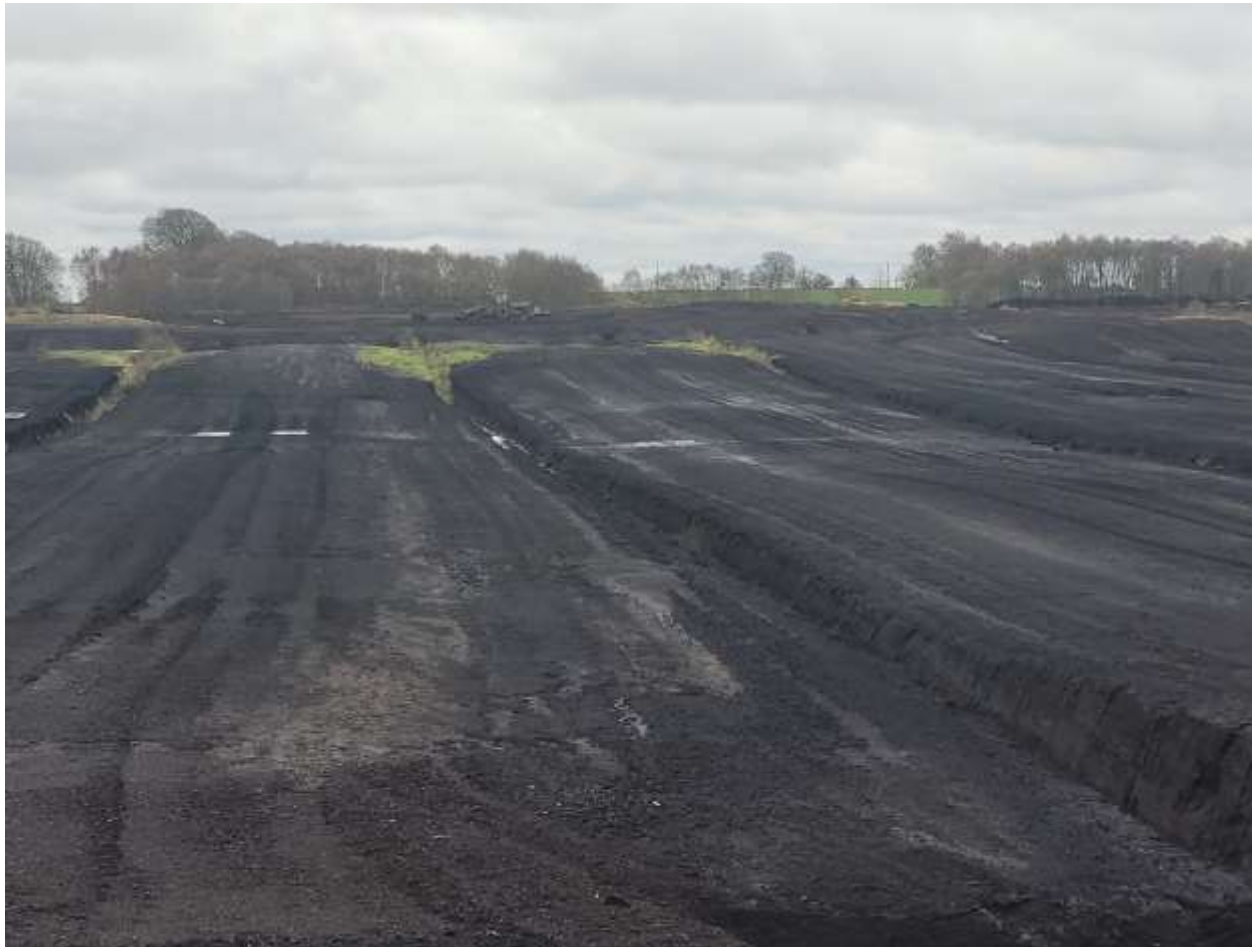
Photo 3: Machinery associated with peat extraction noted on the peatland.