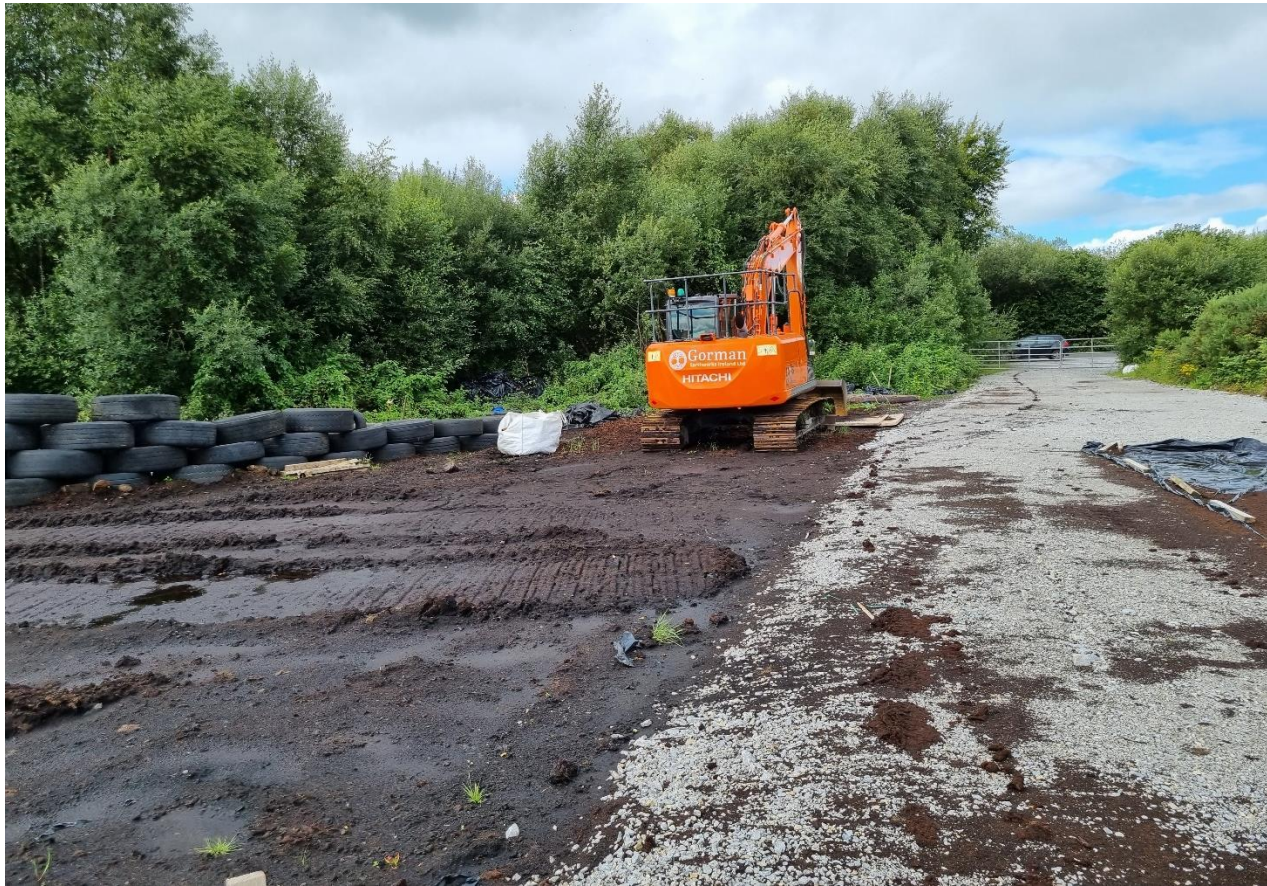
Photo 2: Excavator (with Gorman Earthworks Ireland Ltd logo) at the loading area.