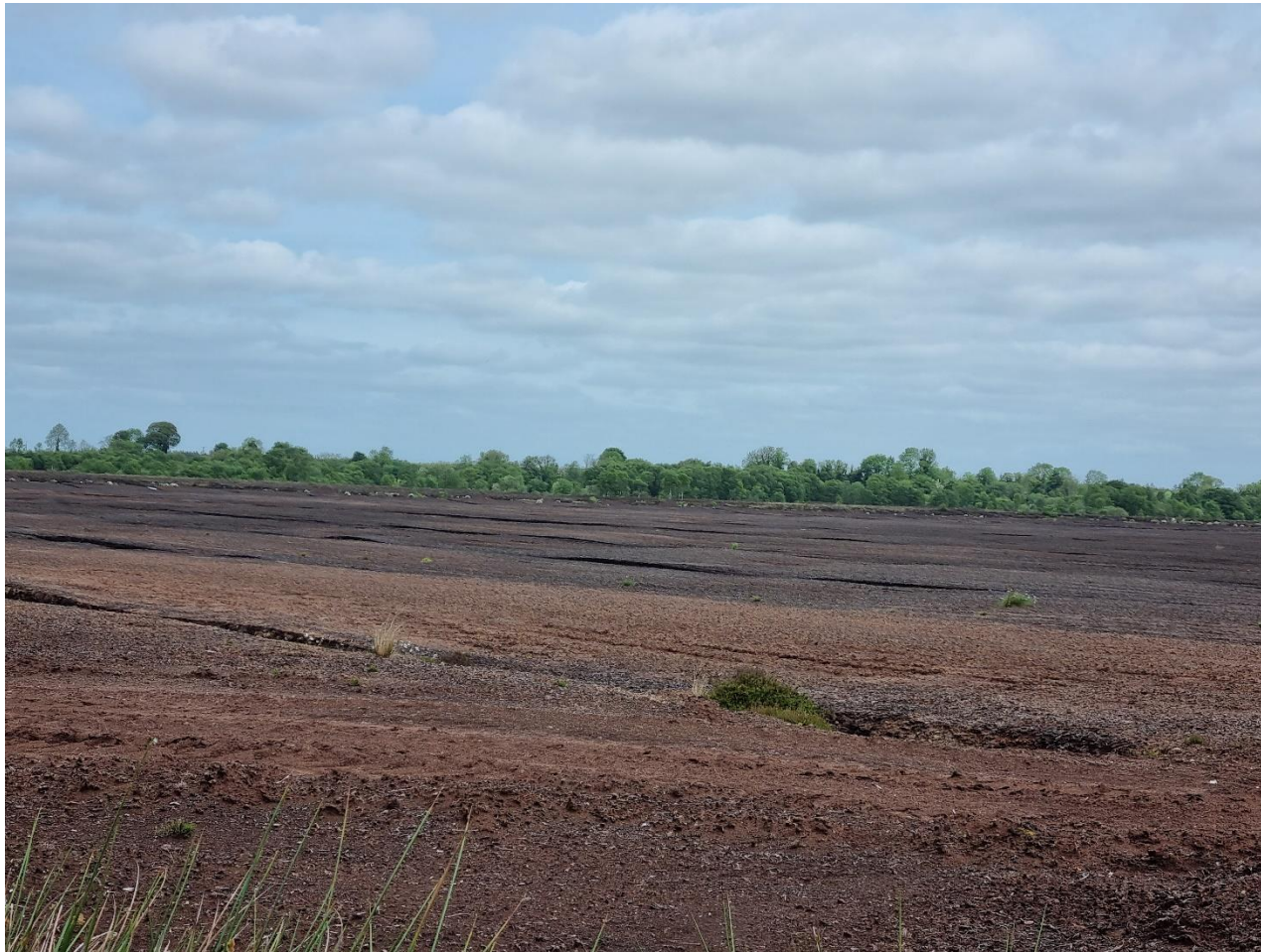
Photo 3: Section of the peatland where milled peat has been carried out in the past at Area 4.