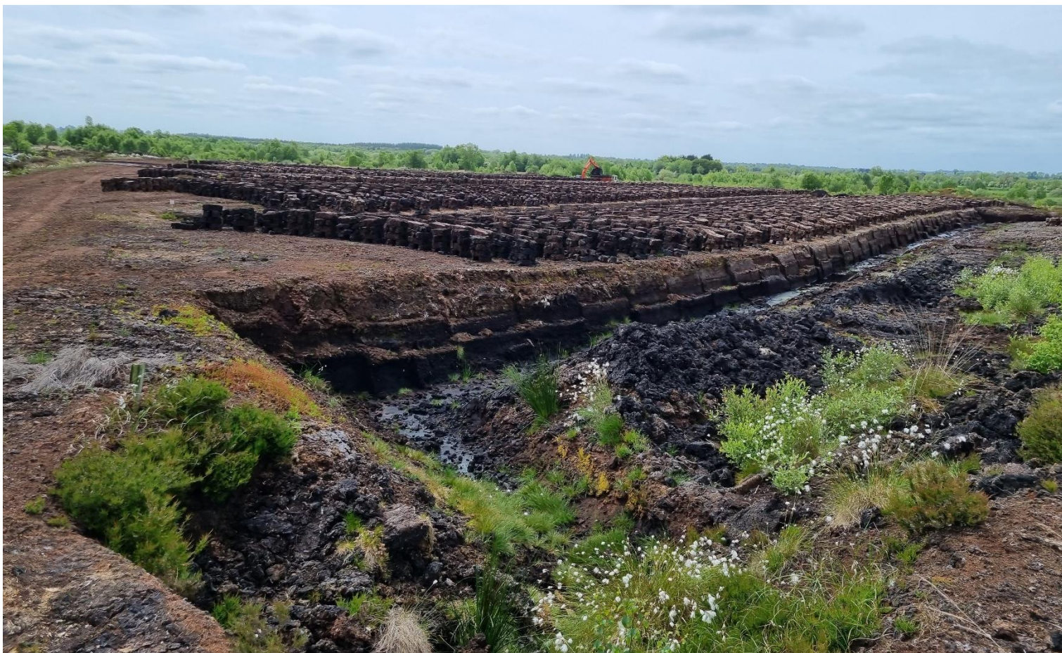
Photo 1: Large sod peat noted at north western section of Area 4, with hopper turf being excavated in the distance.