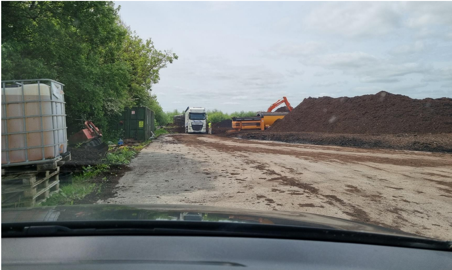
Photo 2: Lorry, excavator, machinery and stockpiles noted at the loading area at Area 4.