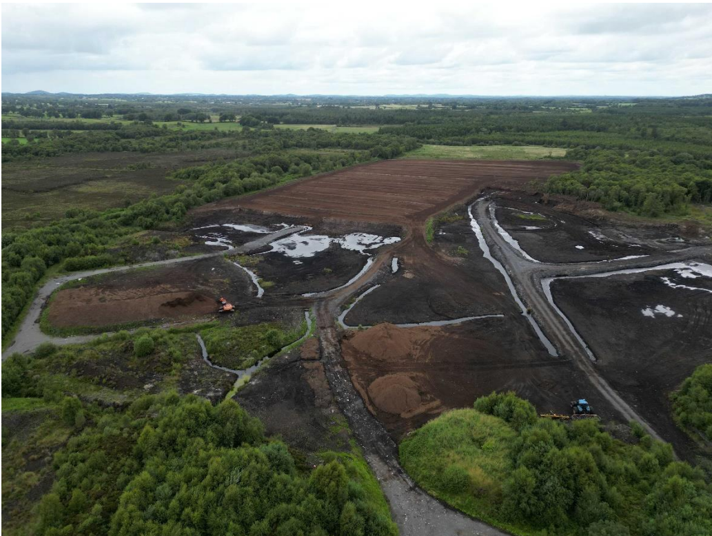
Photo 2 – Eastern part of the site with peat harvesting plant and equipment and stockpile of milled peat.