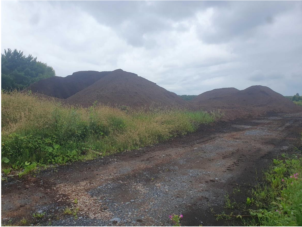
Photo 1 – Stockpile of milled peat in the western part of the site