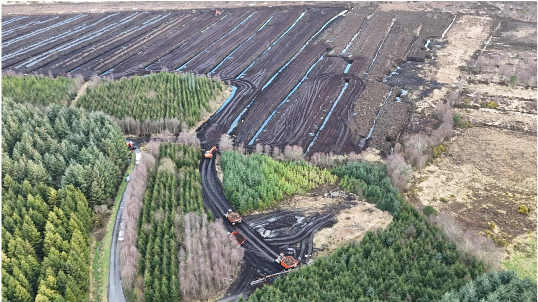
Photo 7: Photo showing large sod peat which was collected from Eastern Section of the peatland being transported to the loading area.