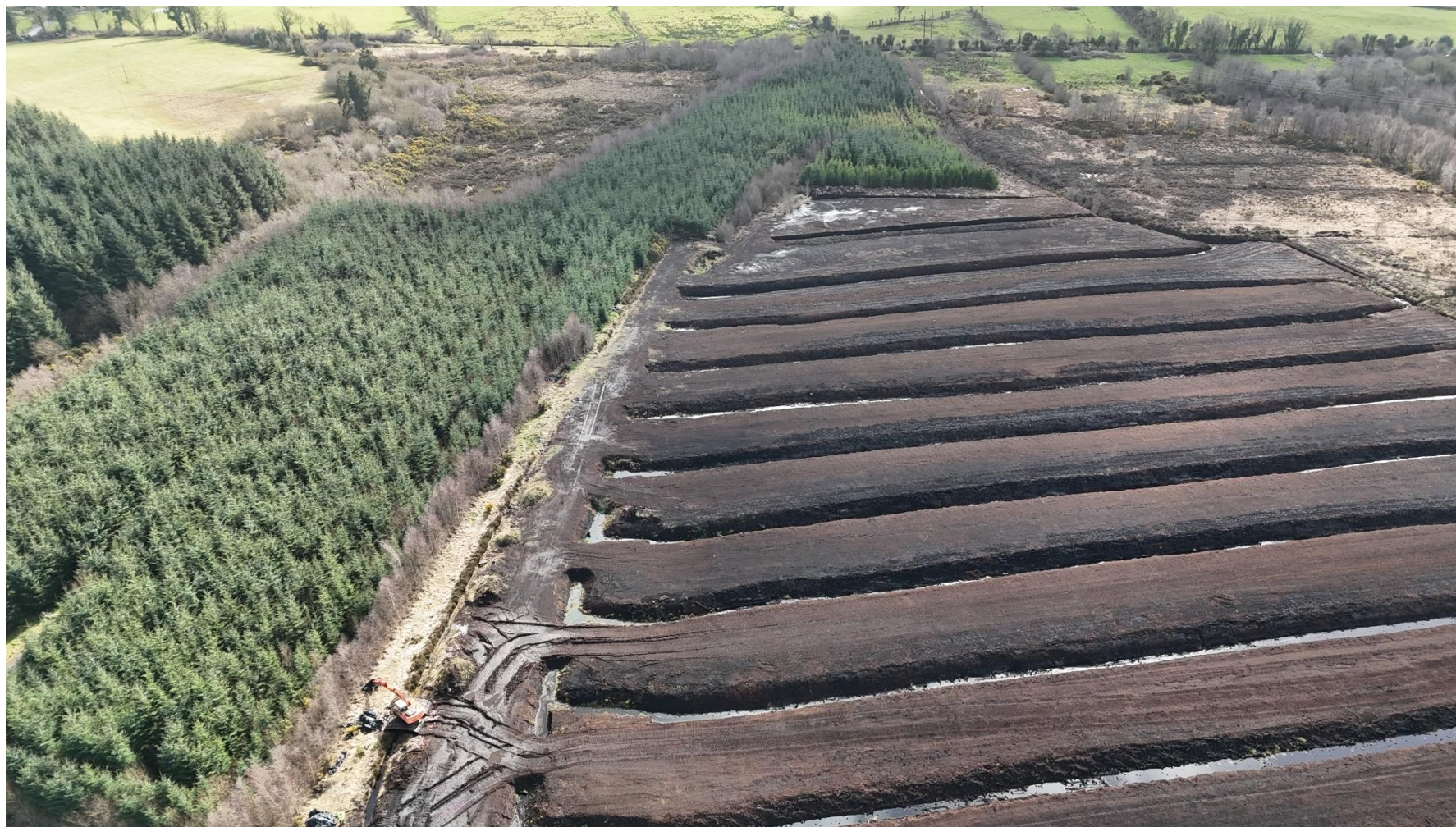
Photo 2 : Section of peatland at the Southern tip of the Western Section where no large sod peat was excavated and left to dry – Note excavator present.