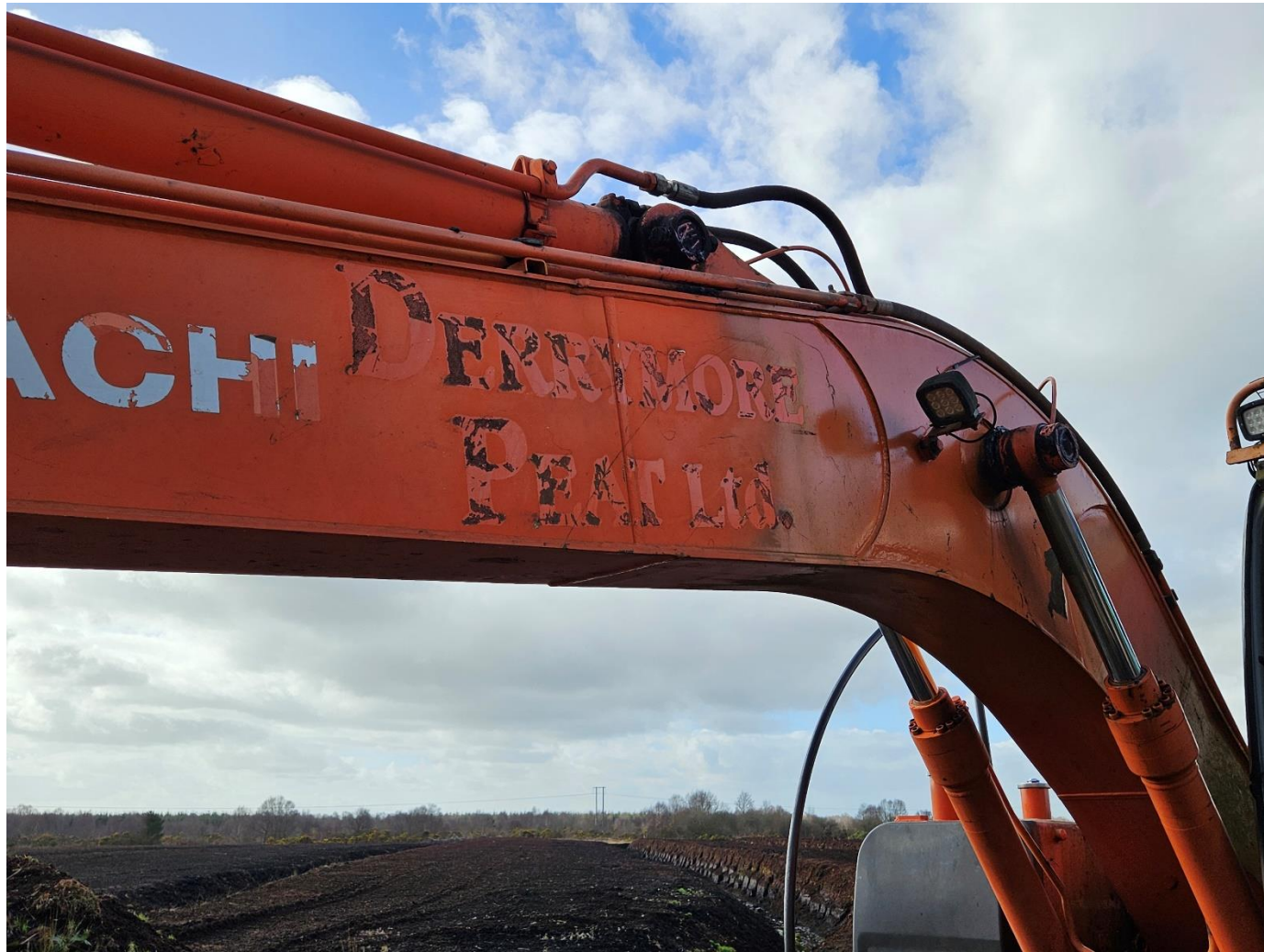
Photo 4 : Excavator with 'Derrymore Peat Ltd' noted at the Western Section of the peatland.