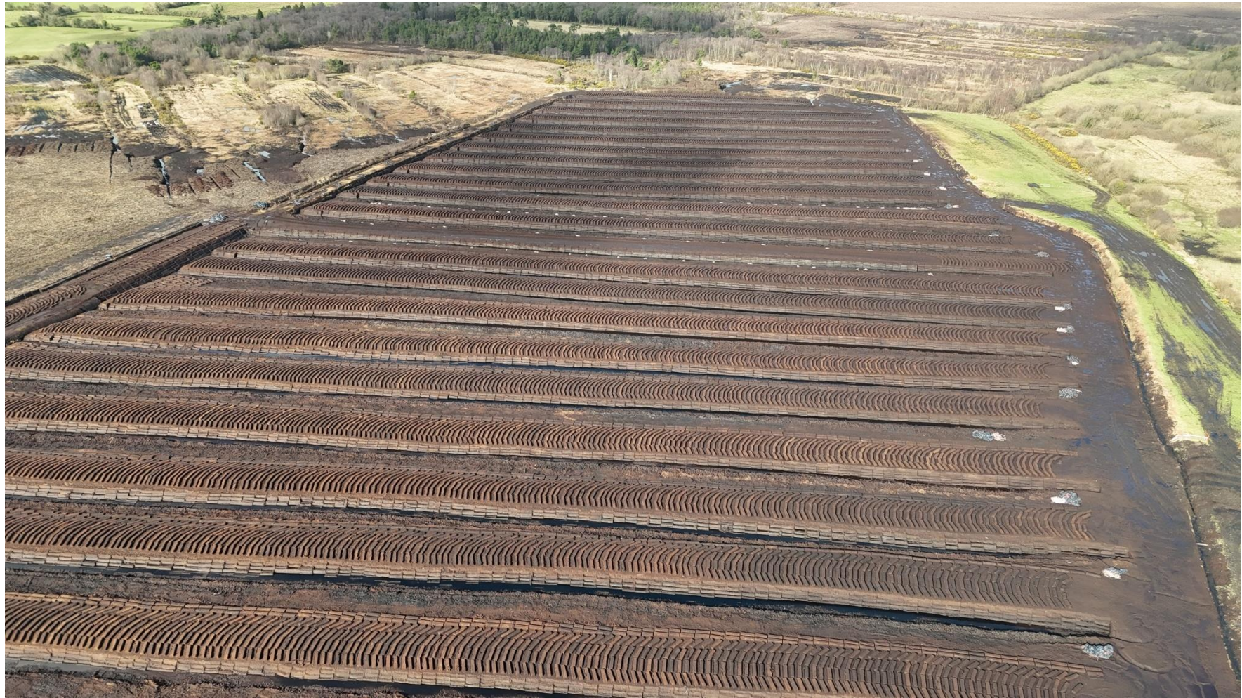
Photo 1 : Large sod peat which was excavated and left to dry on the Western Section of the peatland.