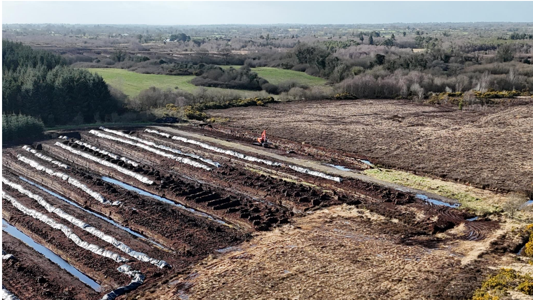
Photo 6: Removal of large sod peat from Eastern Section of the peatland noted to be ongoing during the visit.