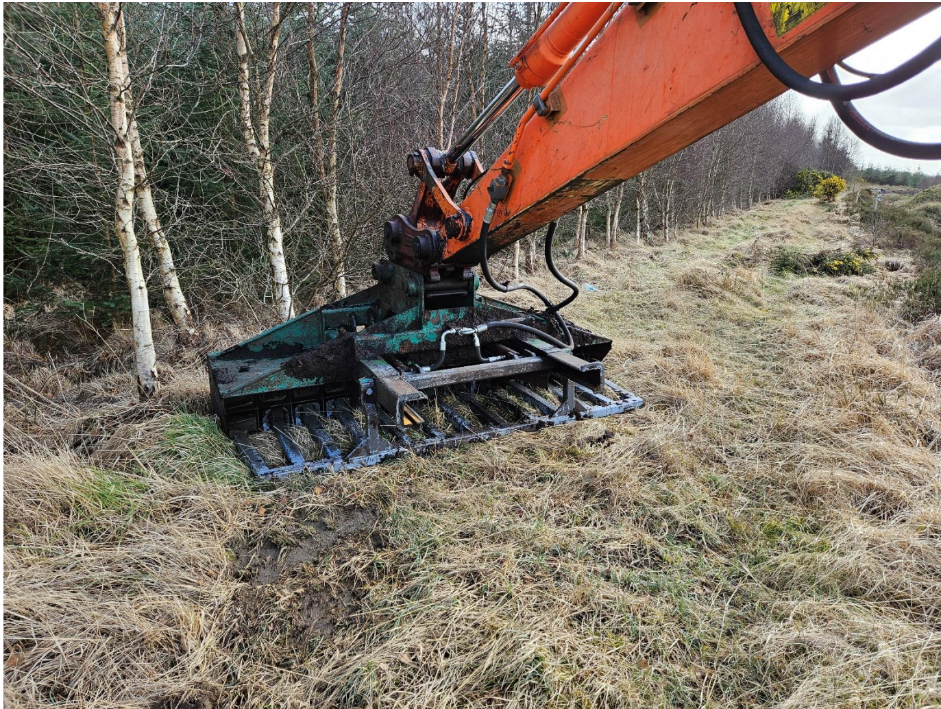
Photo 3 : Excavator with attachment for large sod peat extraction noted at the Western Section of the peatland.