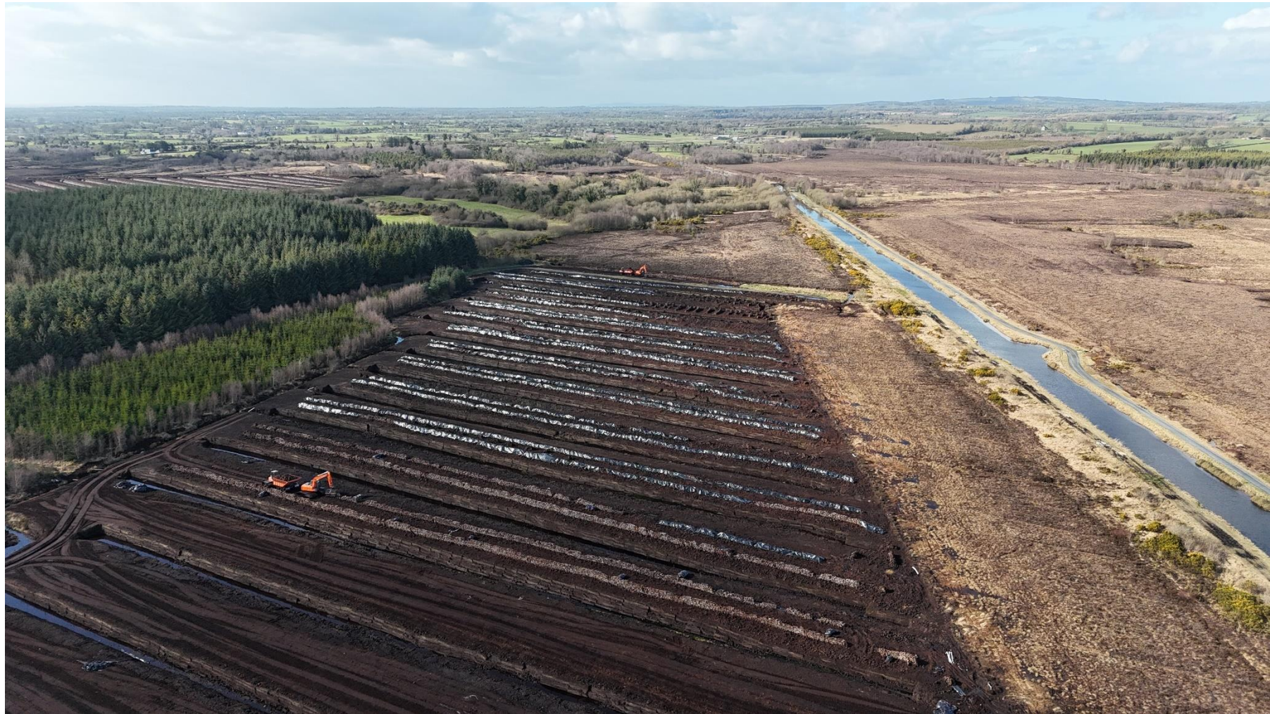
Photo 6: Removal of large sod peat from the Eastern Section of the peatland noted to be ongoing during the visit.