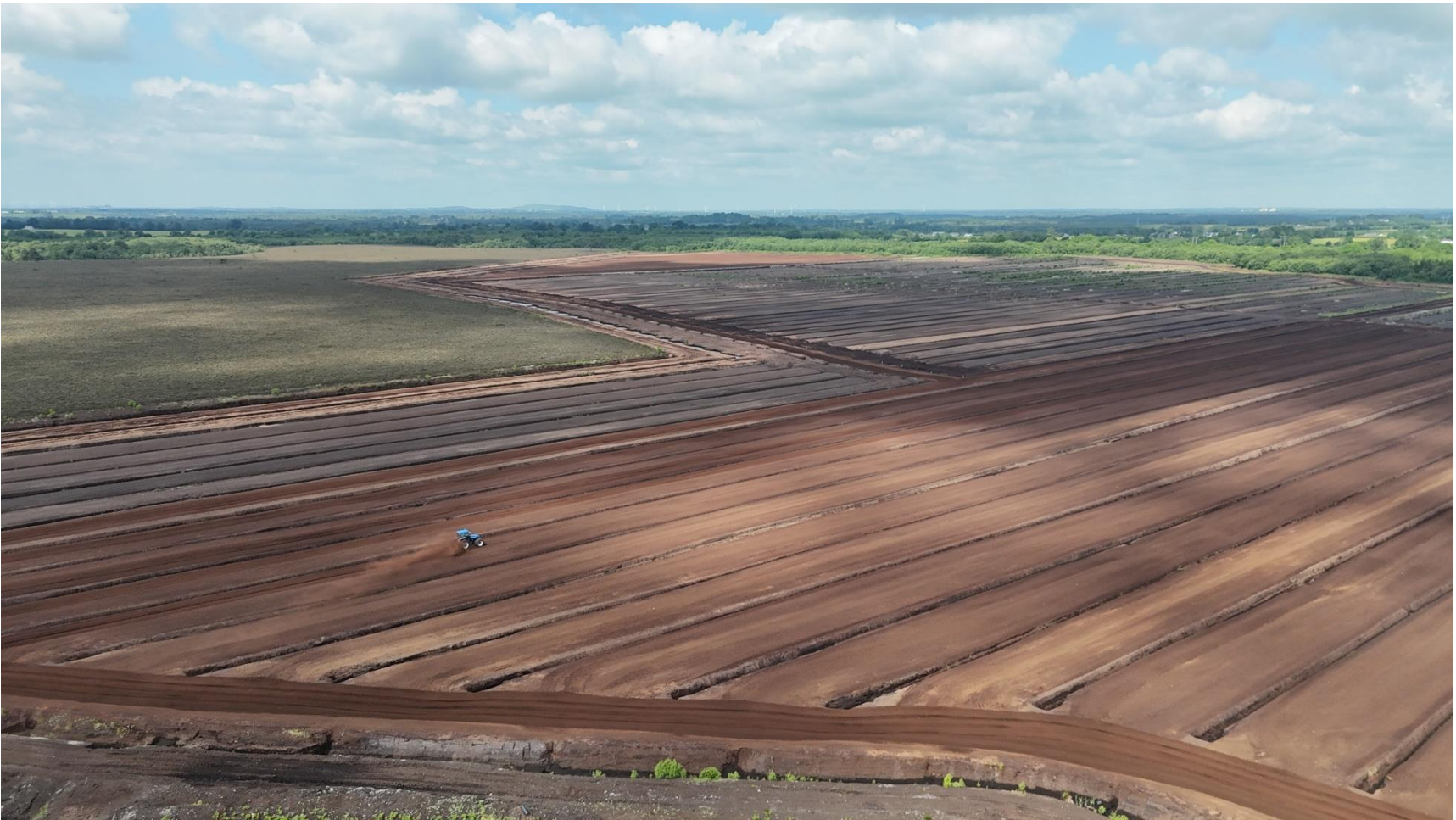
Photo 4: Milled peat extraction was noted to be taking place during the visit.