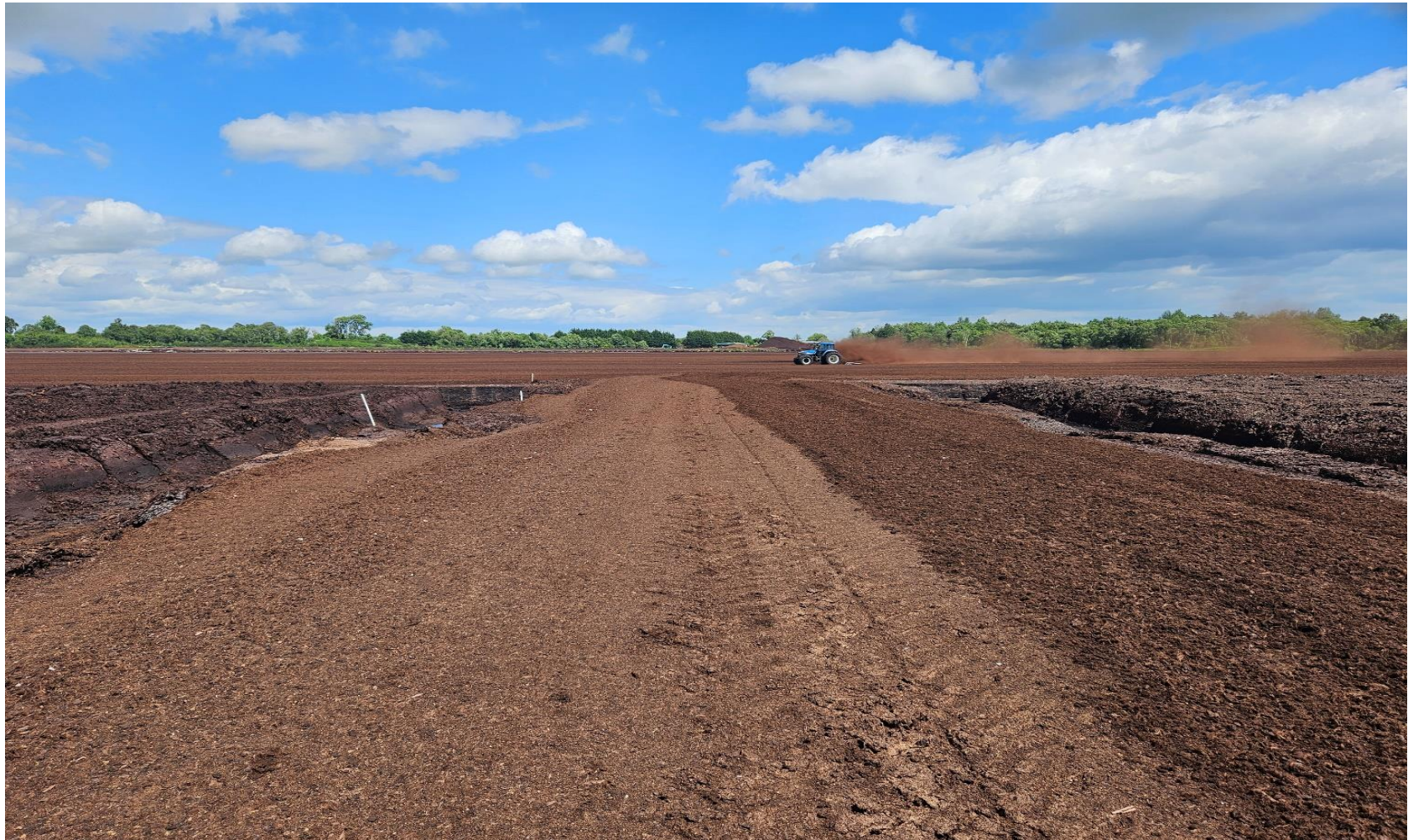
Photo 6– Milled peat extraction activities were ongoing during the visit.