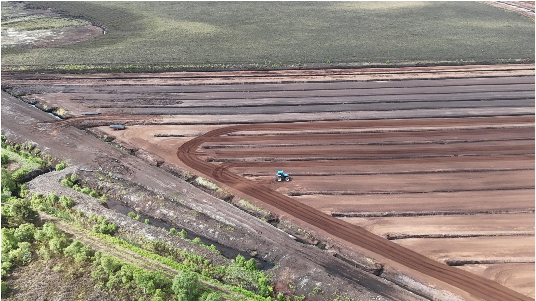
Photo 3: Milled peat extraction was noted to be taking place during the visit.