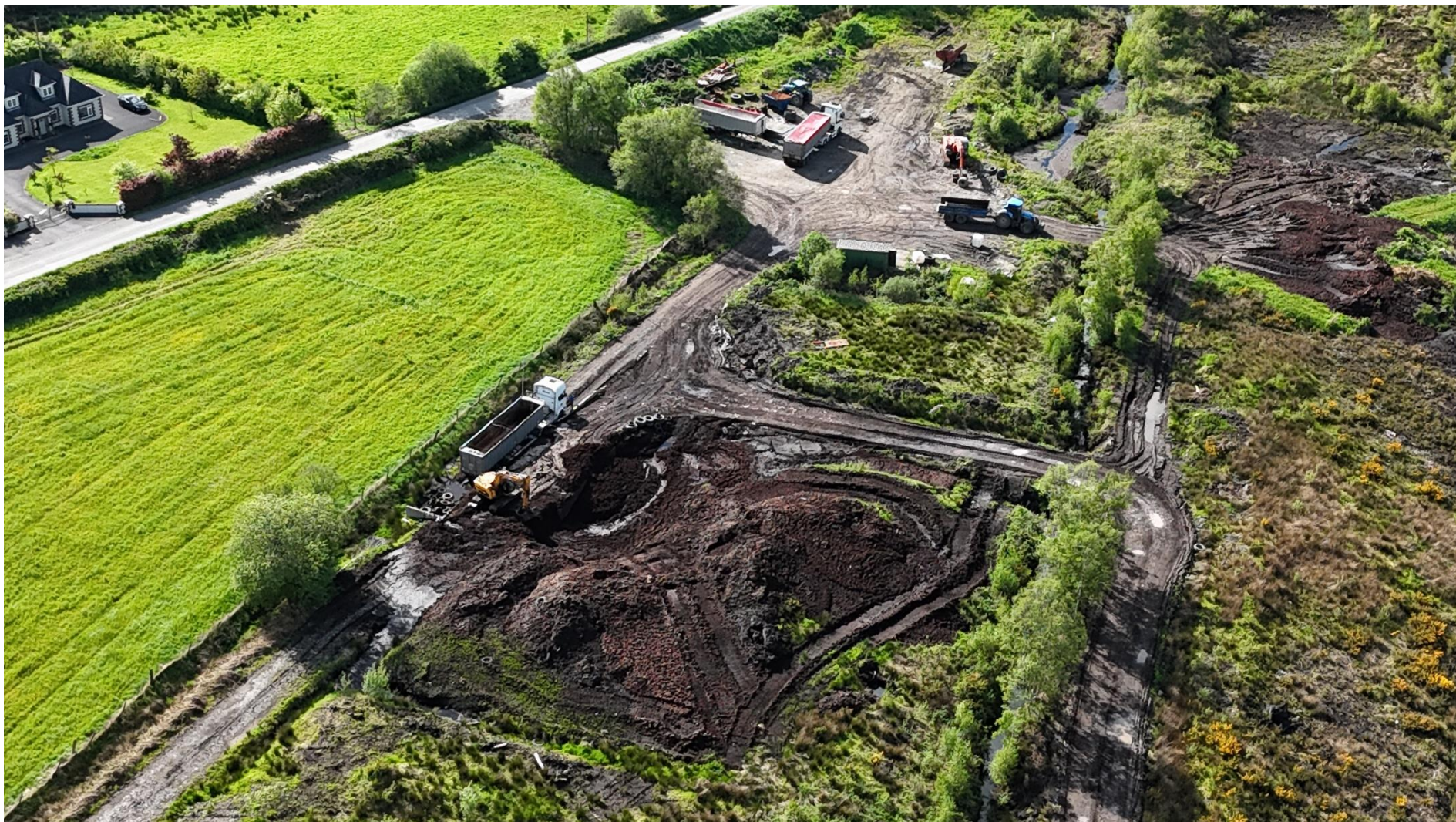
Photo 2: Photo showing peat loading operations in the Northwestern end of the peatland.