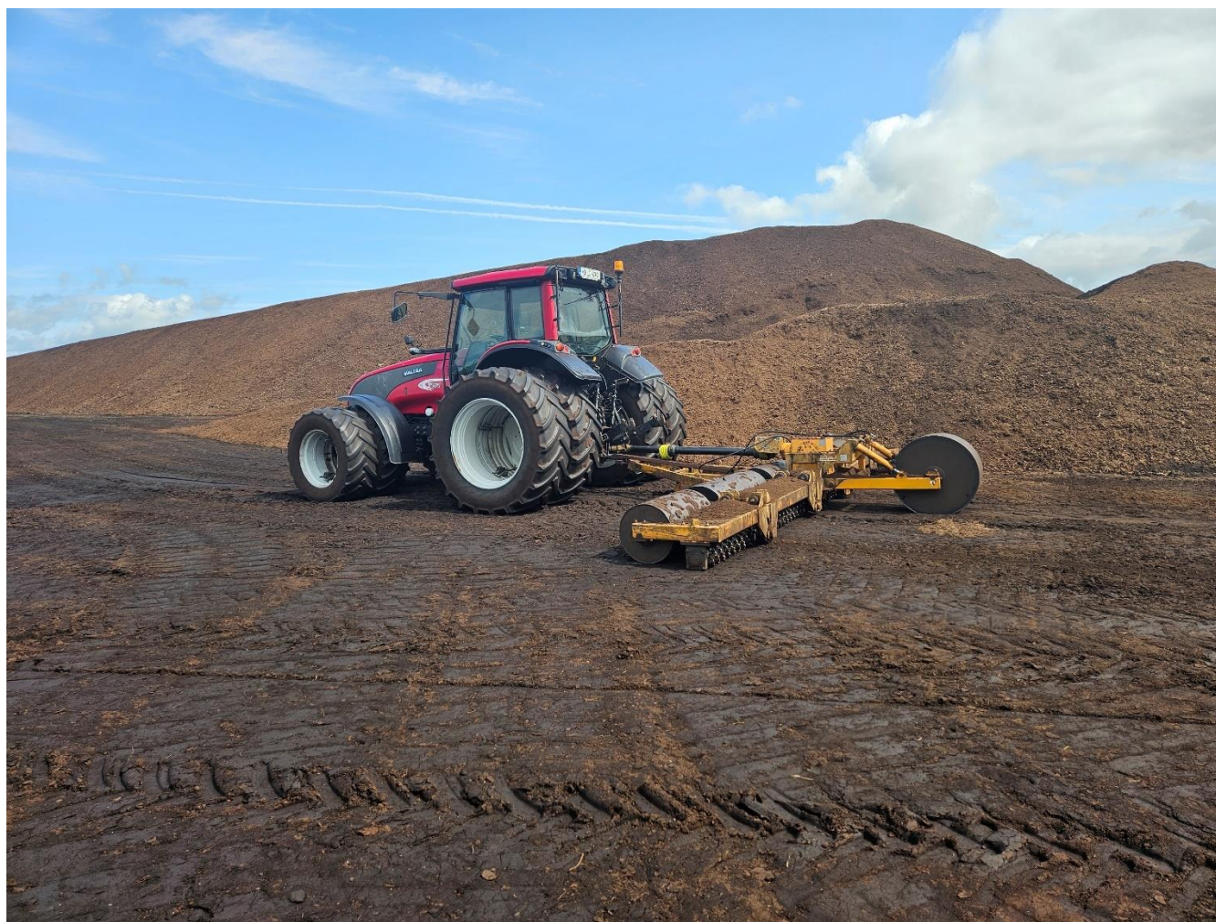
Photo 6: Tractor with 'milling' machine noted adjacent to the stockpiles of milled peat at the loading area.