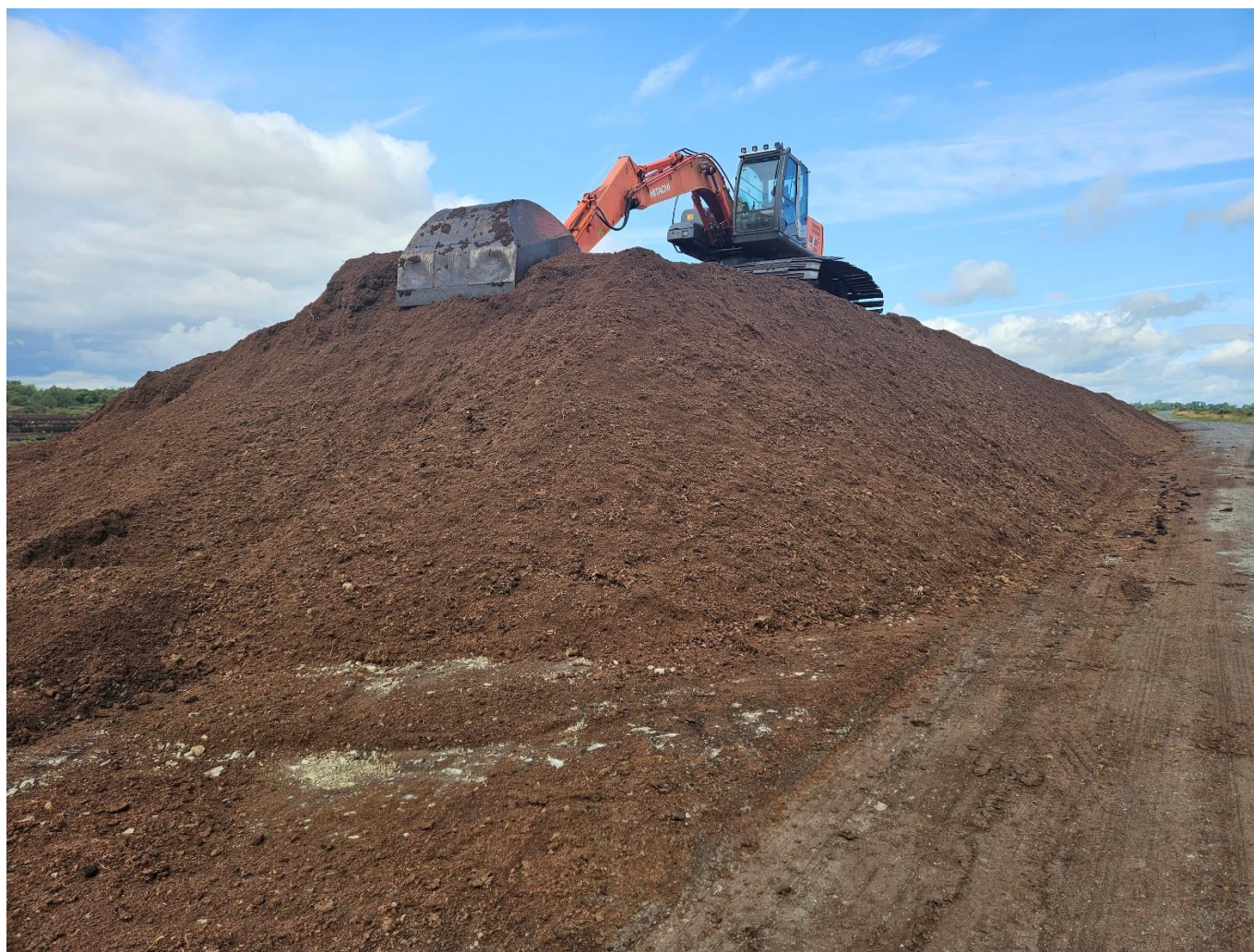
Photo 3: Excavator noted on large stockpile of milled peat at the loading area.