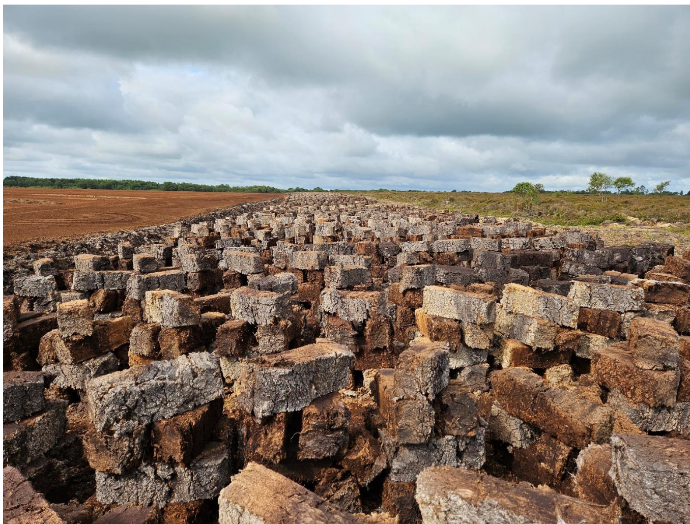
Photo 5: Large sod peat stacked for drying at the Northern part of the peatland.