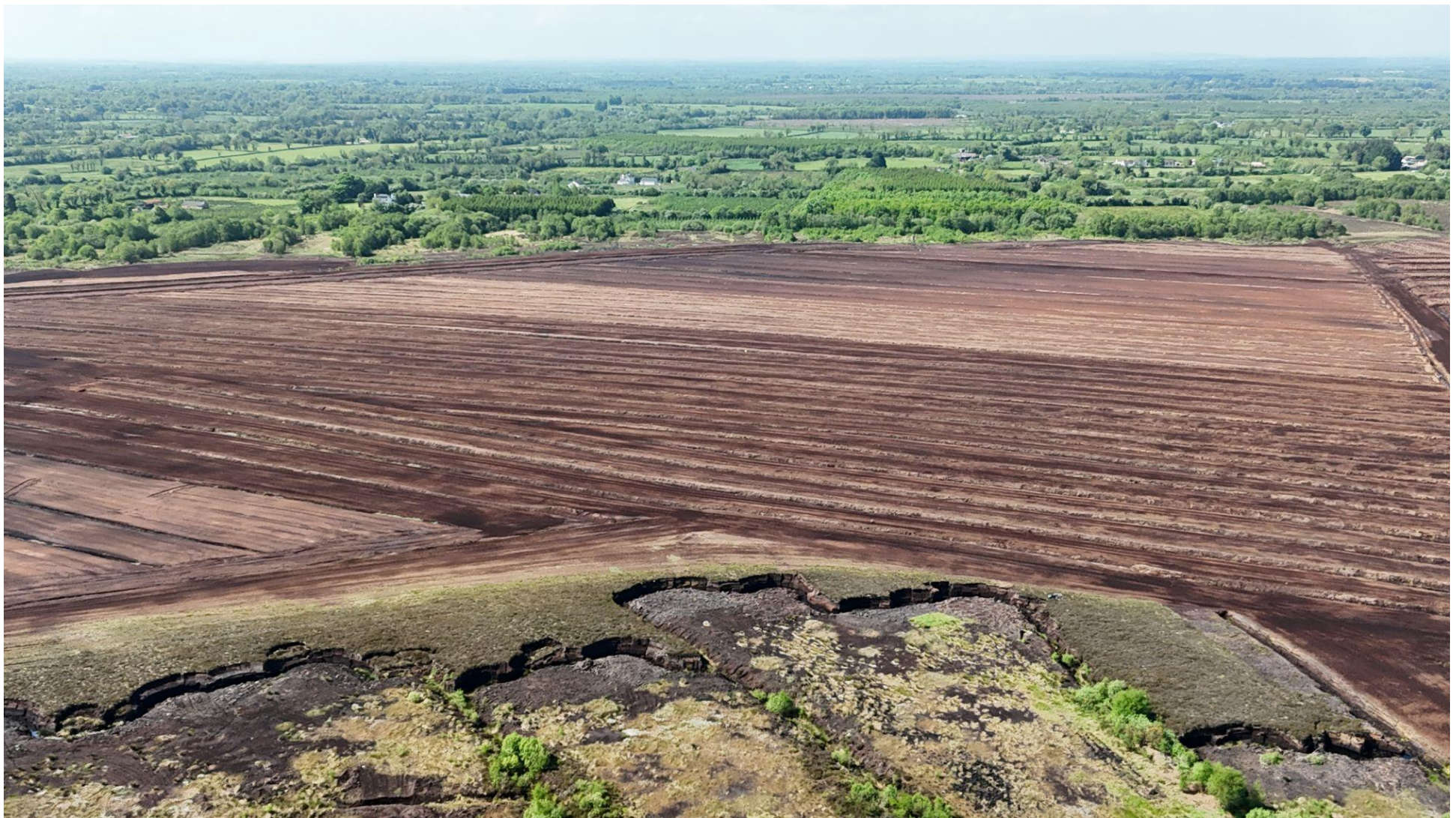
Photo 2: Area along the western/north western side of the peatland where drains had been cleared.