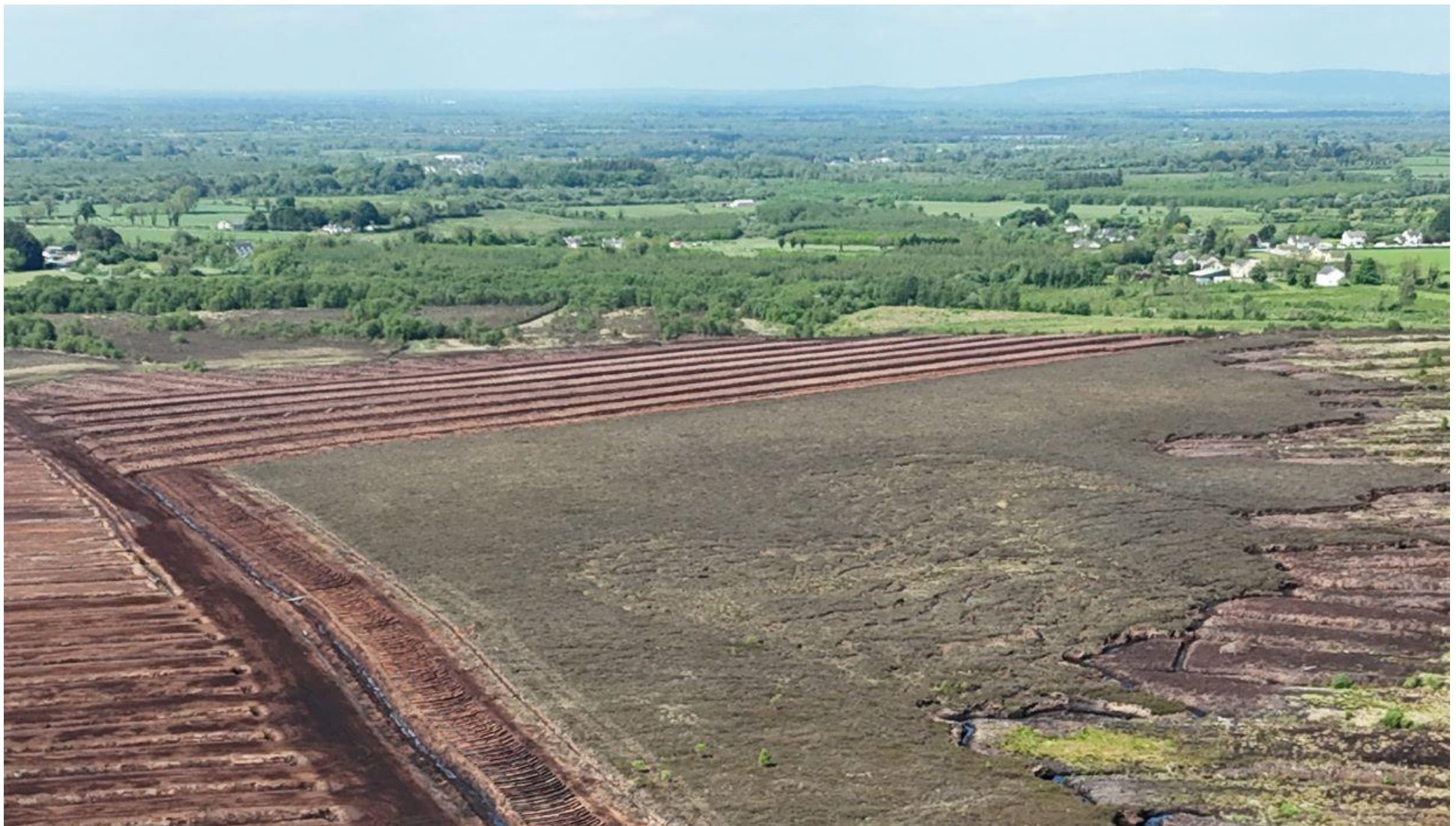
Photo 3: Area at the north western part of the site where large sod had recently been excavated.