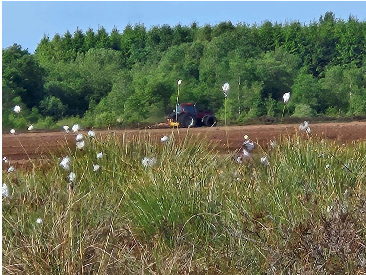
Photo 6: Milled peat harrowing was noted to be taking place during the visit.