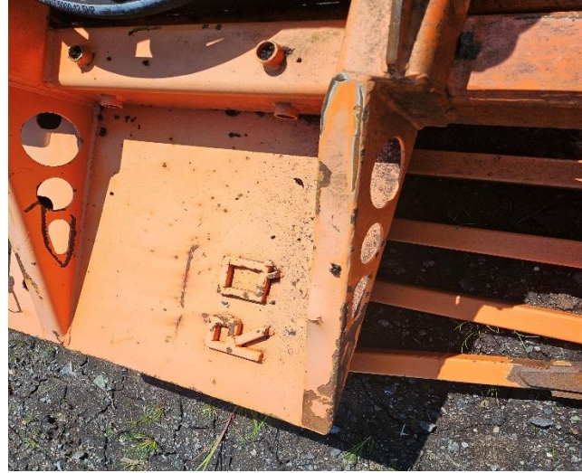
Photos 11, 12 & 13: Large sod peat extraction attachments were noted at the loading area.