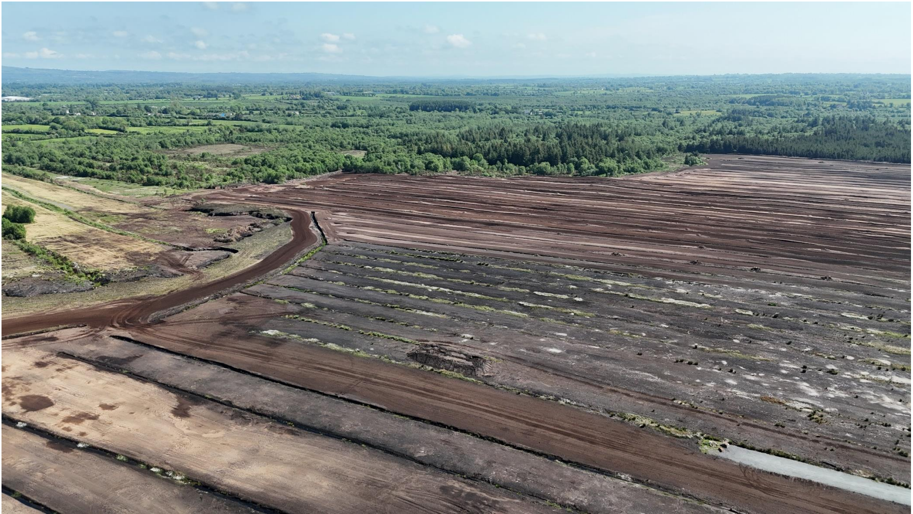
Photo 2: General overview of the North/North eastern section of the peatland.