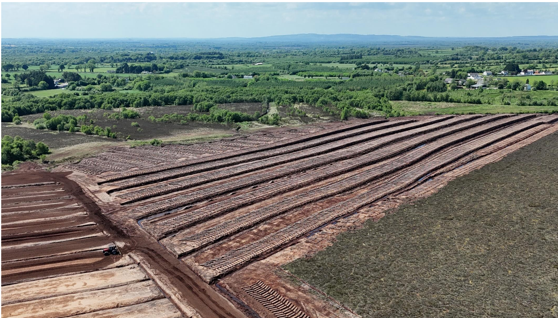
Photo 5: View of section of the peatland where large sod peat had recently been excavated, note milled peat extraction taking place also.