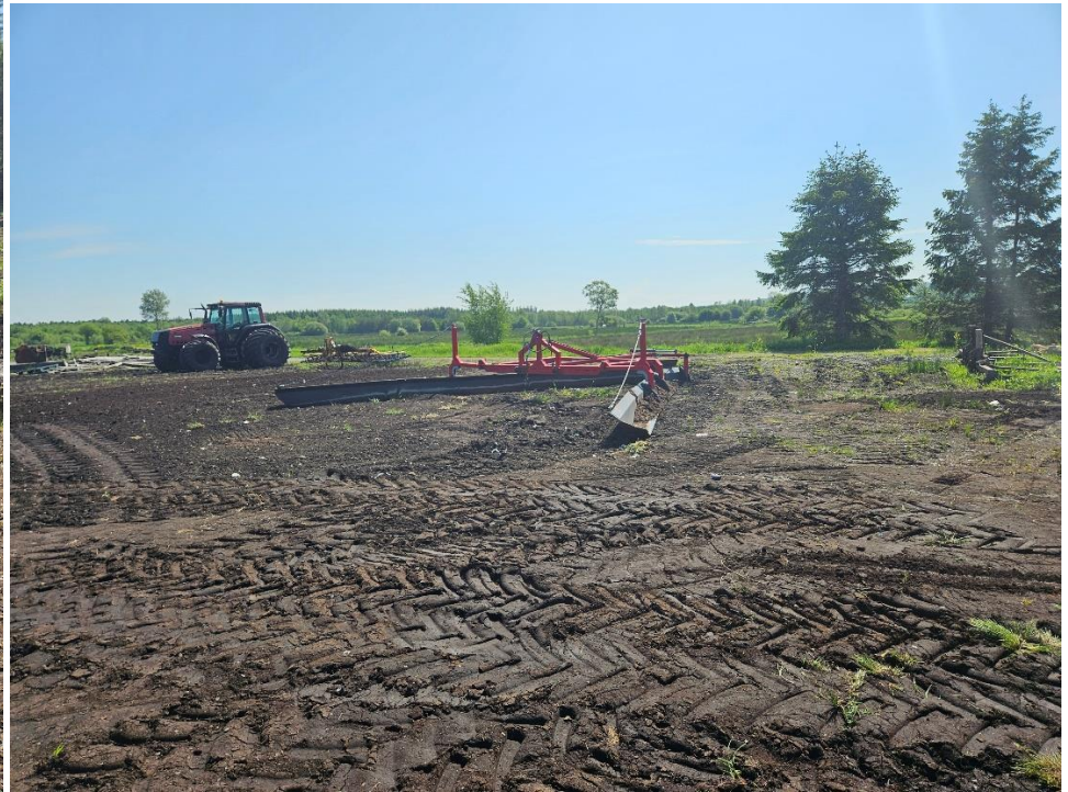
Photos 9 & 10: Milled peat extraction machinery and equipment noted at the loading area.