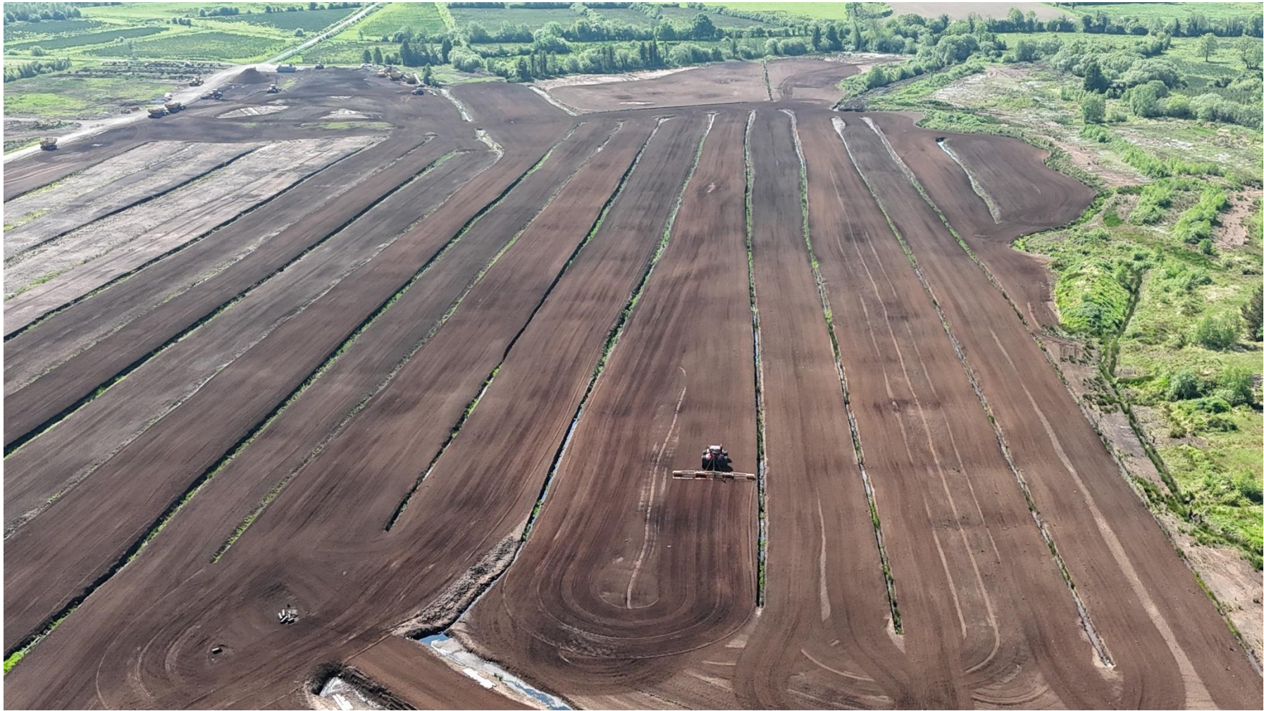
Photo 4: Milled peat harrowing was noted to be taking place during the visit.