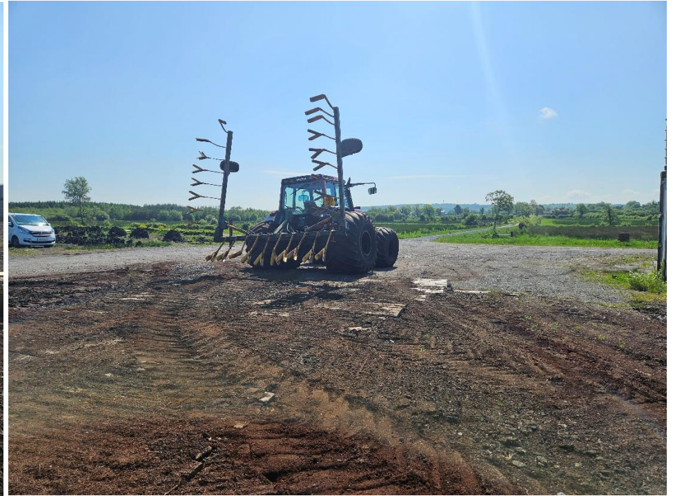
Photos 7 & 8: Milled peat extraction machinery and equipment noted at the loading area.