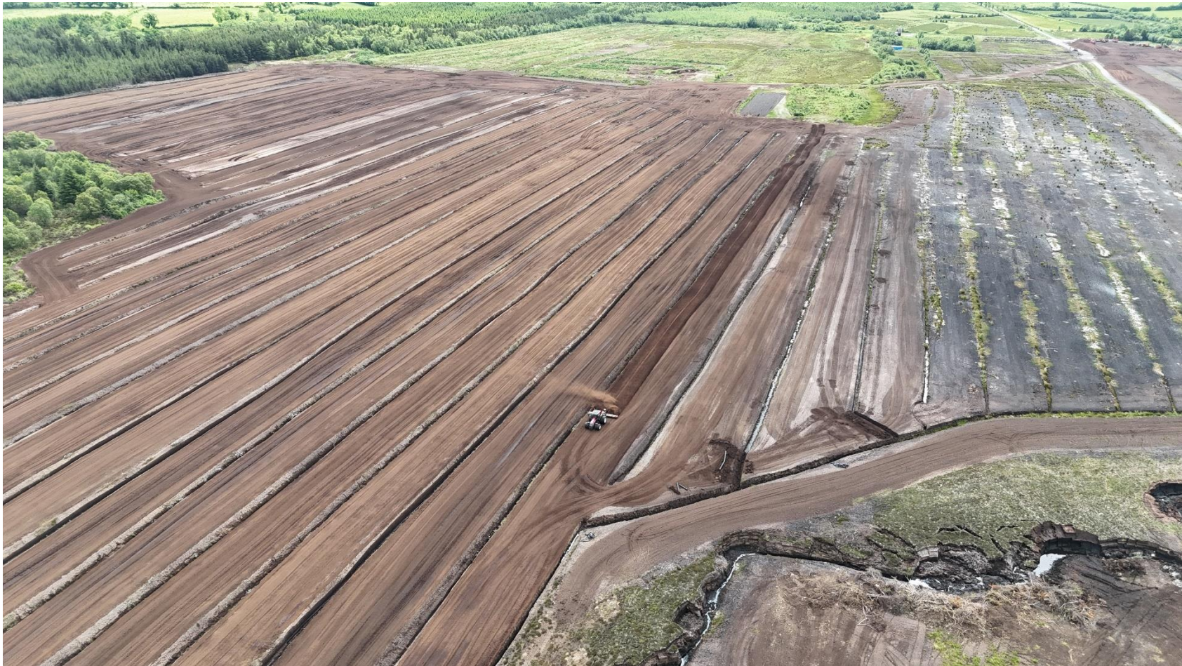
Photo 3: Milled peat extraction noted at the Northern part of the peatland.