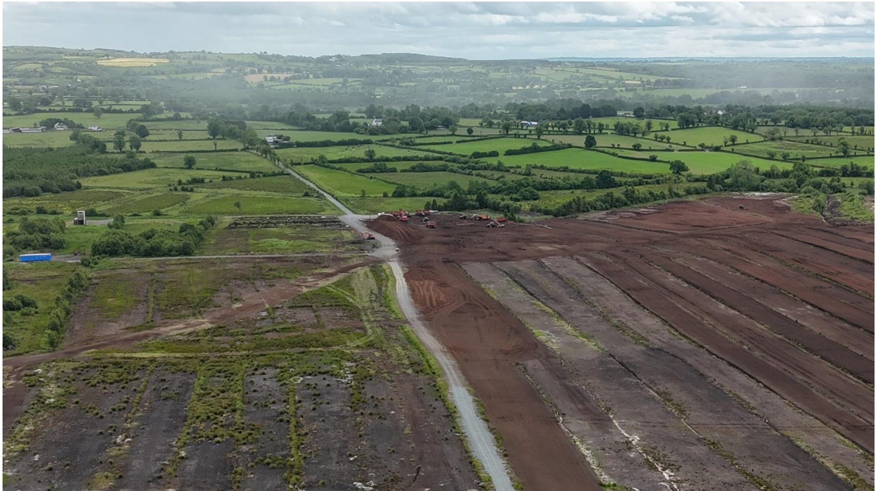
Photo 2: Milled peat extraction noted to be taking place at the South Western tip of the peatland.