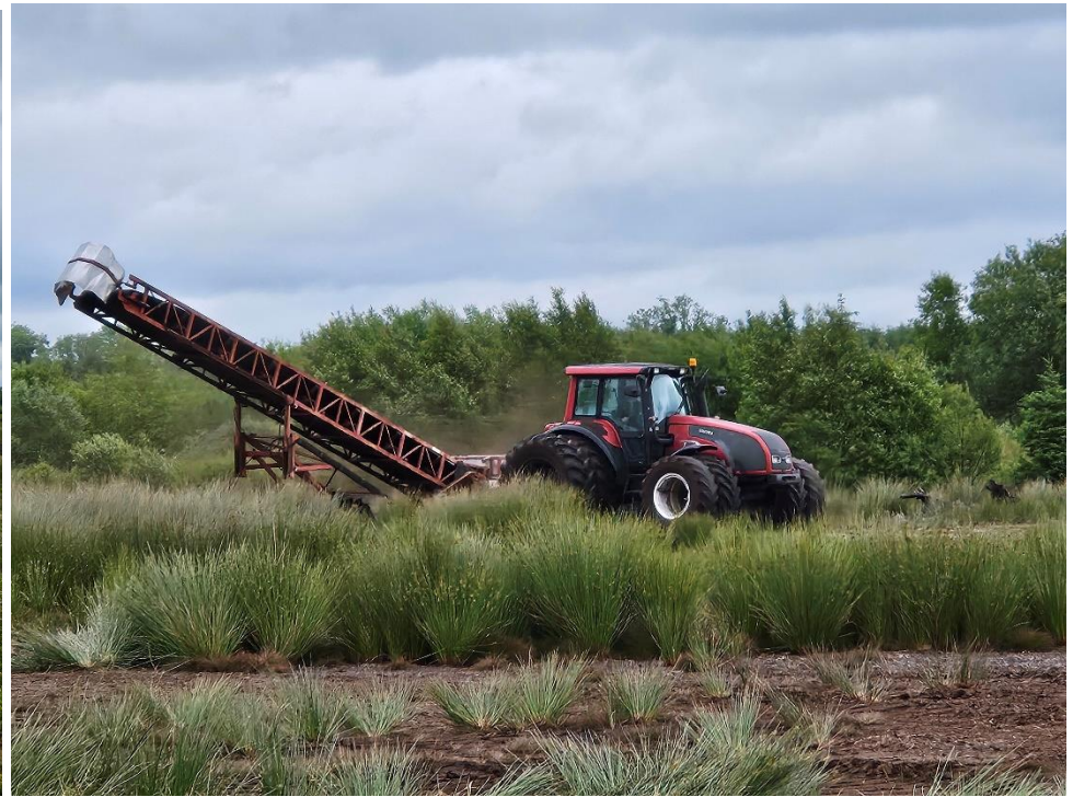
Photos 9 & 10: Machinery for the collection and transport of milled peat noted during the visit.