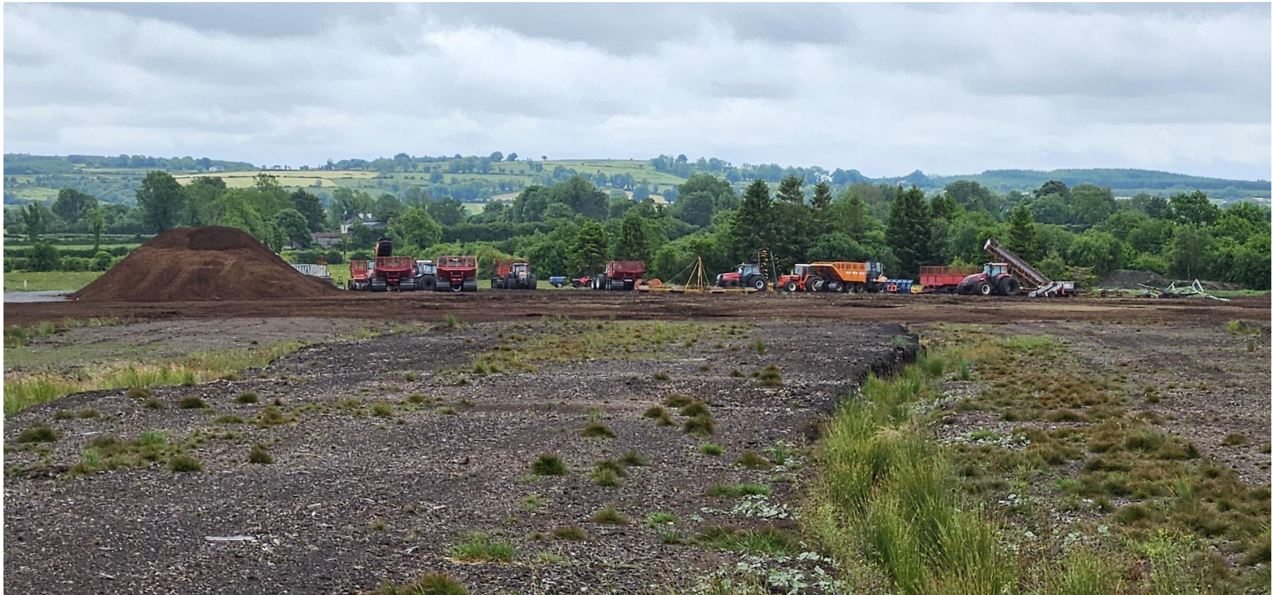
Photo 11: Machinery and equipment for milled peat extraction noted at/adjacent to the loading area, note stockpiles of milled peat also.