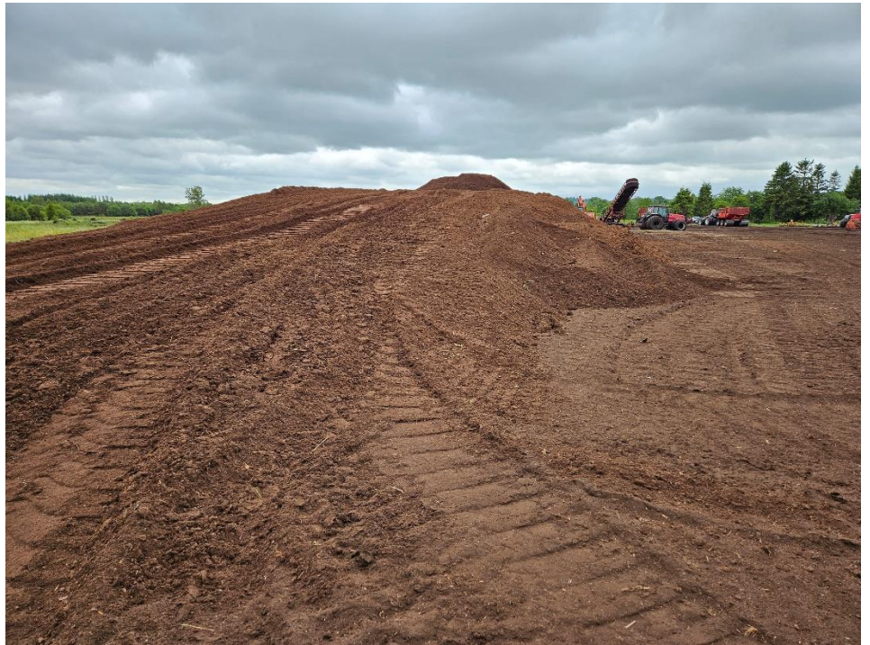
Photos 7 & 8: Significant stockpiles of milled peat at the loading area at the Southern part of the peatland.