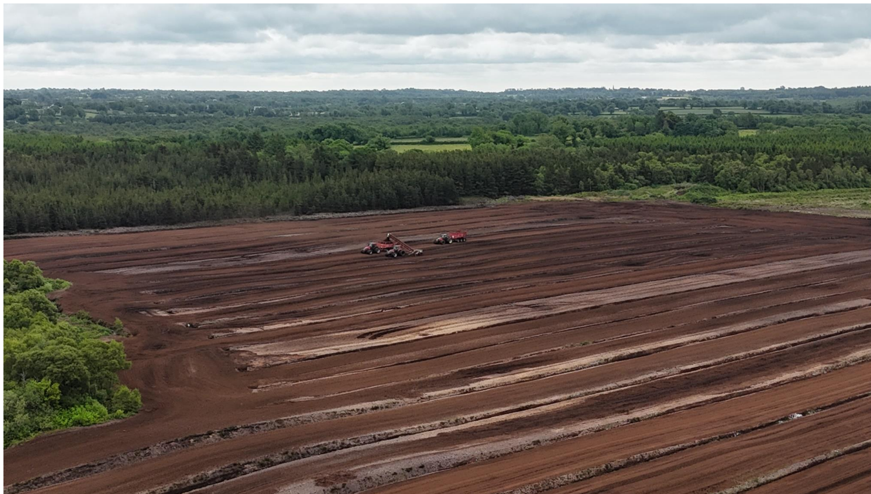
Photo 1: Collection of milled peat was noted to be taking place at the Eastern side of the peatland.