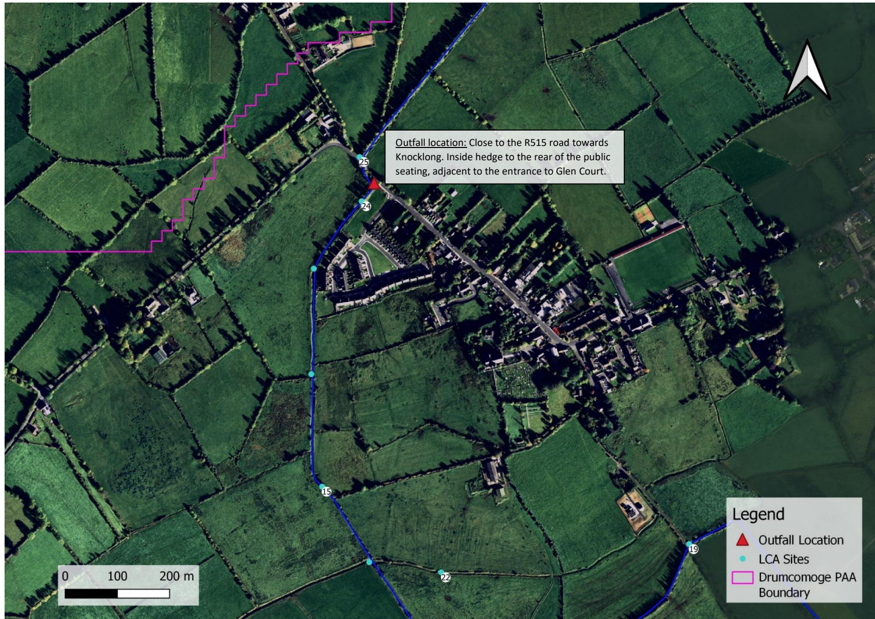
Figure 2: Map shows the outfall location and the local catchment assessment sites in the vicinity of Emly.