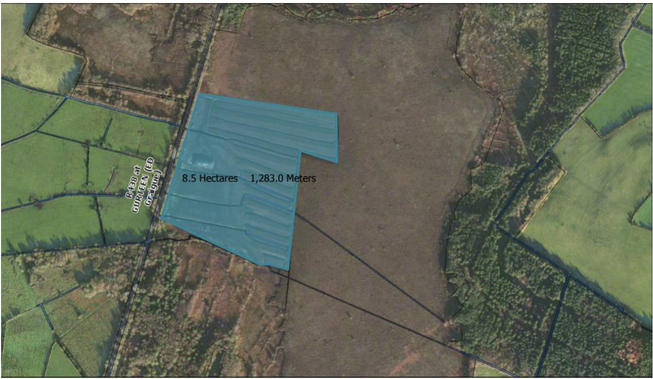
Total Extraction Area

E. An assessment of the distance and hydraulic connection between the peat extraction areas identified and any Natura 2000 sites or Natural Heritage Areas (proposed or otherwise);